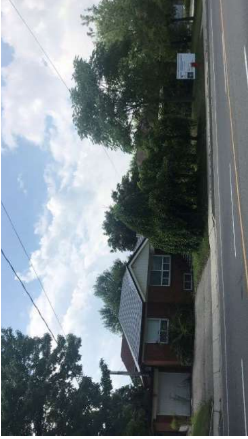
Image of existing conditions facing northwest