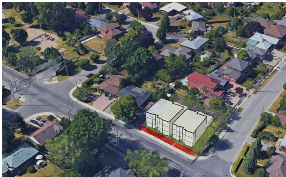
Applicant's rendering of the proposed semi-detached homes