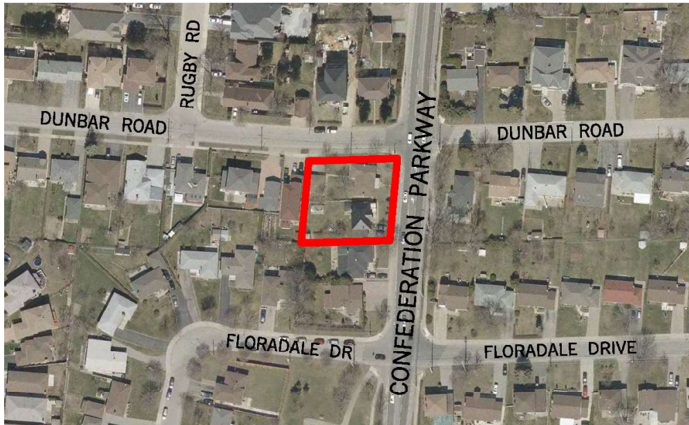
Aerial image of 2476 and 2482 Confederation Parkway

The property is located within the Cookville Neighbourhood Character Area at the southwest corner of Dunbar Road and Confederation Parkway. The site is currently occupied by two single detached homes.