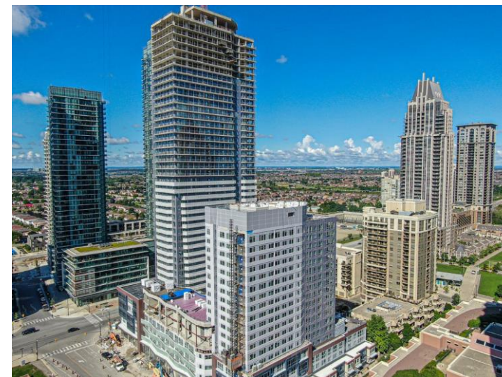
Region of Peel affordable housing project