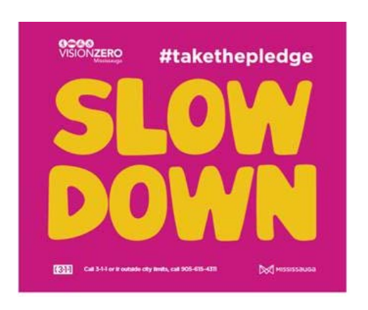
Option 2: (two colour choices)