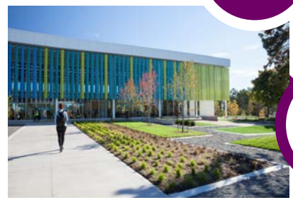
2016 - Meadowvale Community Centre opens and receives award for barrier-free design