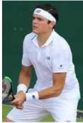
Milos Raonic Wimbledon Finalist World #3 Career High 28 years old