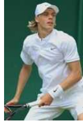
Denis Shapovalov Rogers Cup Semi Finalist World #15 ATP 19 years old