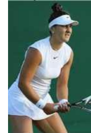
Bianca Andreescu Grand Slam Champion #4 World Ranking 18 years old