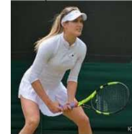
Genie Bouchard Wimbledon Finalist World #5 Career High 24 years old