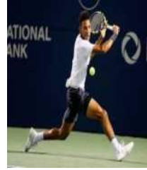
Felix Auger-Aliassime 250 Champion World #18 ATP 18 years old