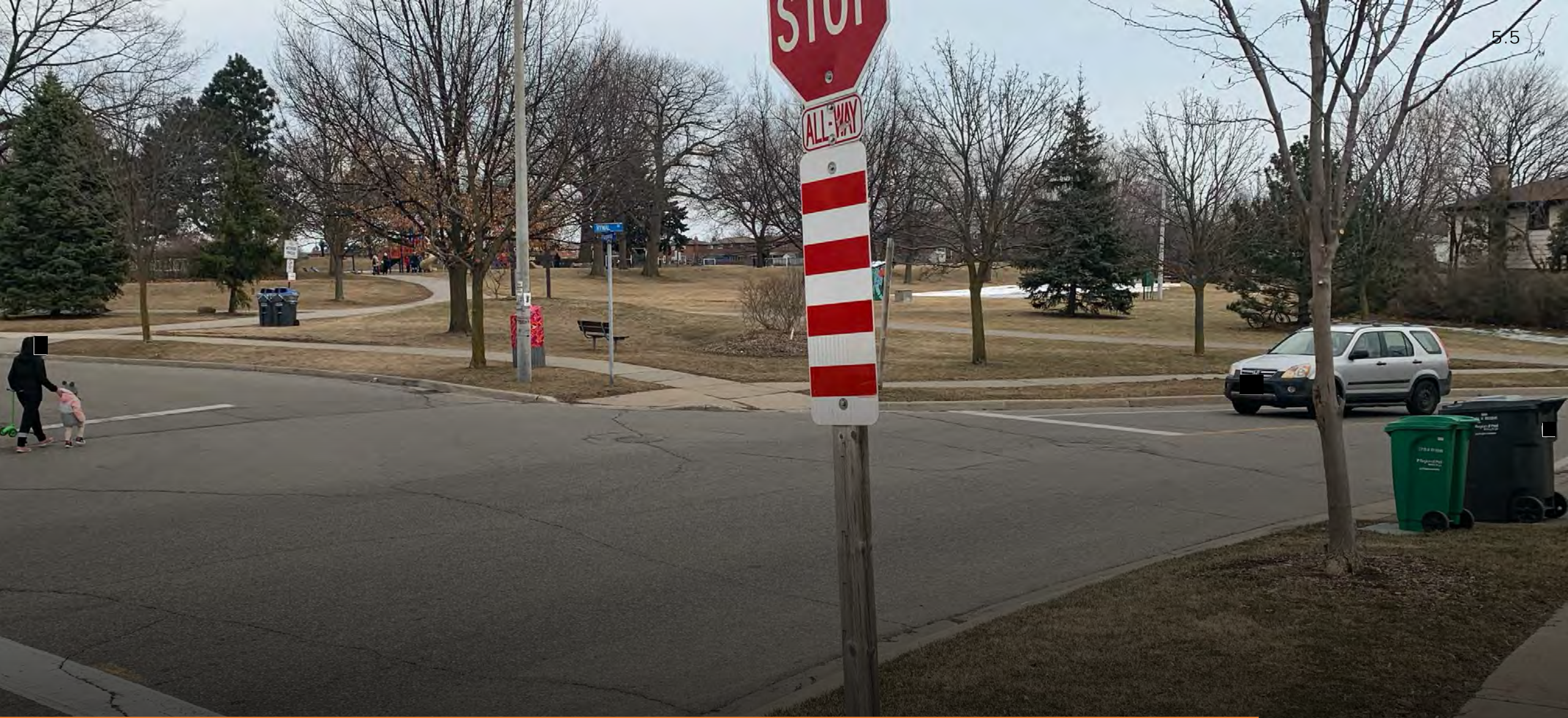
Neighbourhood is heavily skewed to families with small children and park usage has increased because of COVID