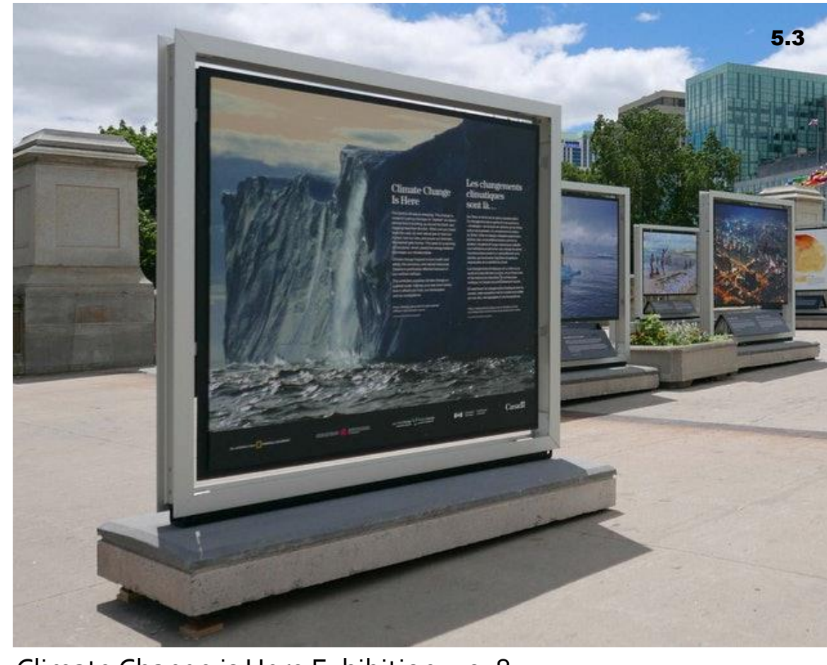
Climate Change is Here Exhibition, 2018 Ingenium + National Geographic