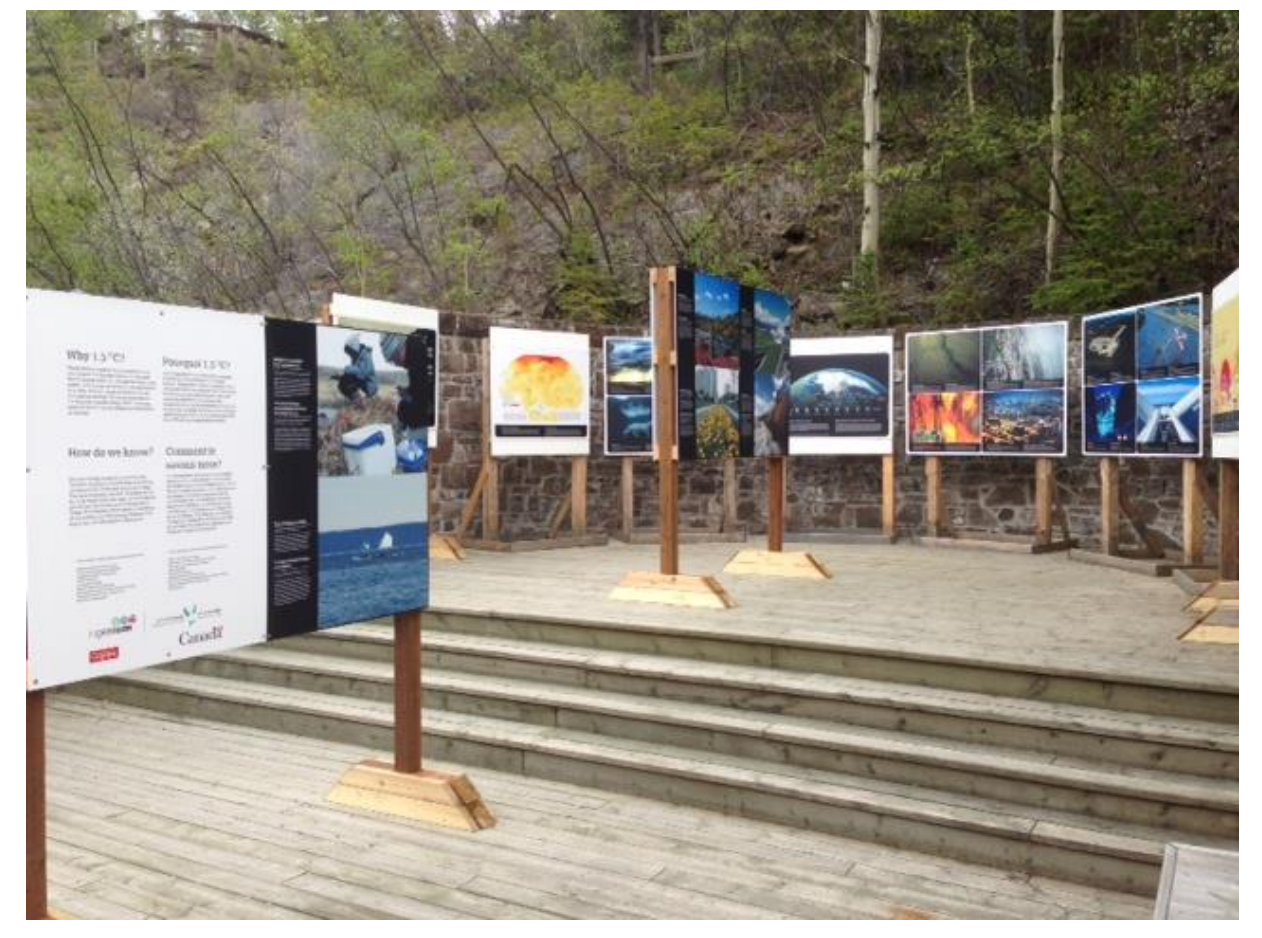
To What Degree: Canada in a Changing Climate Exhibition, 2019 Ingenium + Canadian Geographic