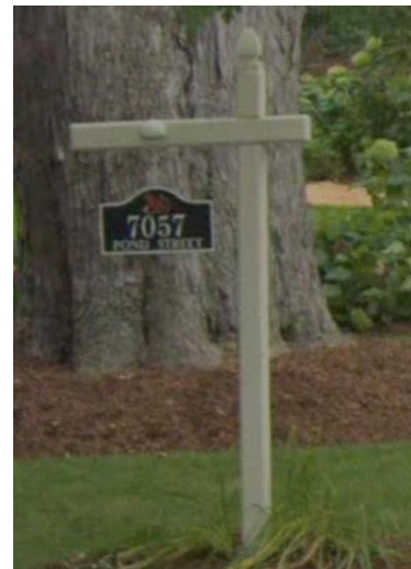
Figure 3: Sign Precedent

I trust that the revised access sign design proposal is satisfactory to the Heritage Advisory Committee, and I would welcome the opportunity to speak to the revised design. Please do not hesitate to contact me with any questions or concerns.