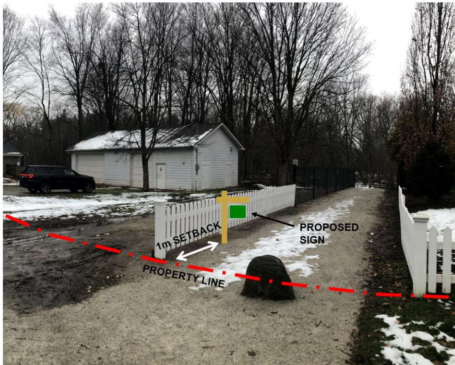
Figure 1: Sign Location and Massing