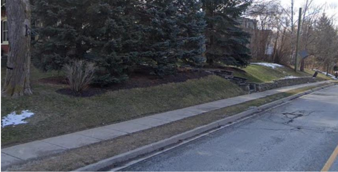
Area of widened sidewalk, facing west