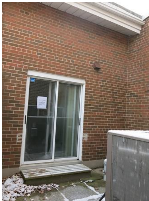
Mechanical courtyard door