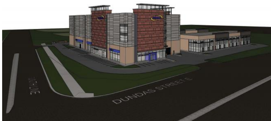
Applicant's 3D view of the proposed five storey self-storage building and two storey industrial condominium buildings from Ninth Line and Dundas Street West