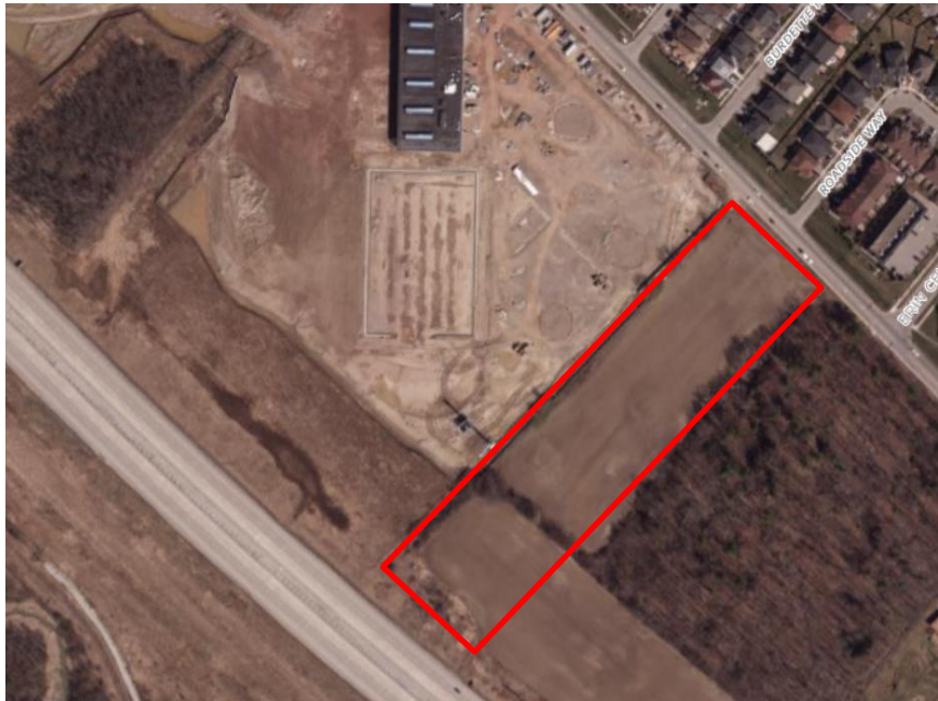
Aerial Photo of Subject Lands (Lot 2, Concession 9, New Survey)