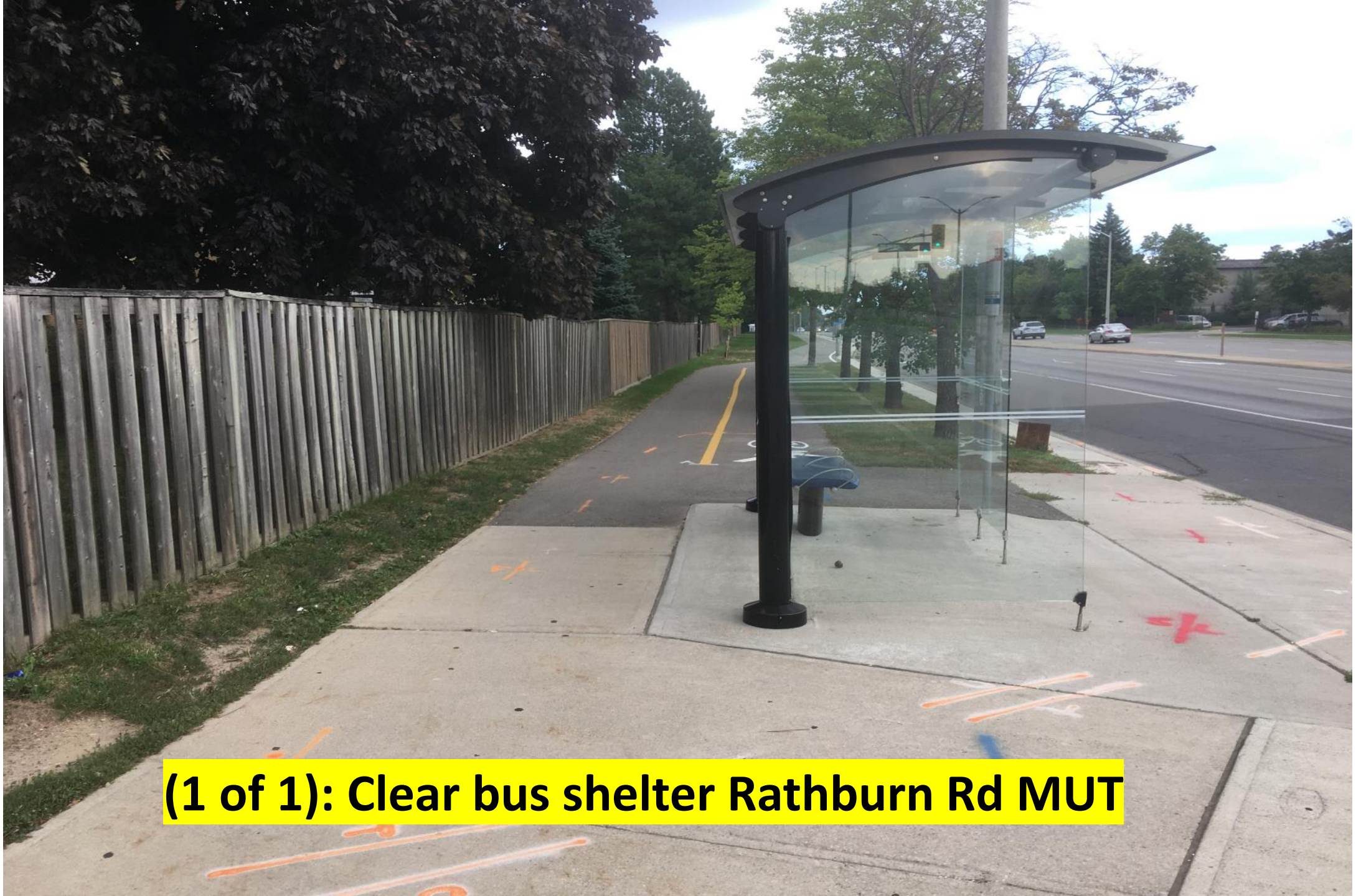
(1 of 1): Clear bus shelter Rathburn Rd MUT