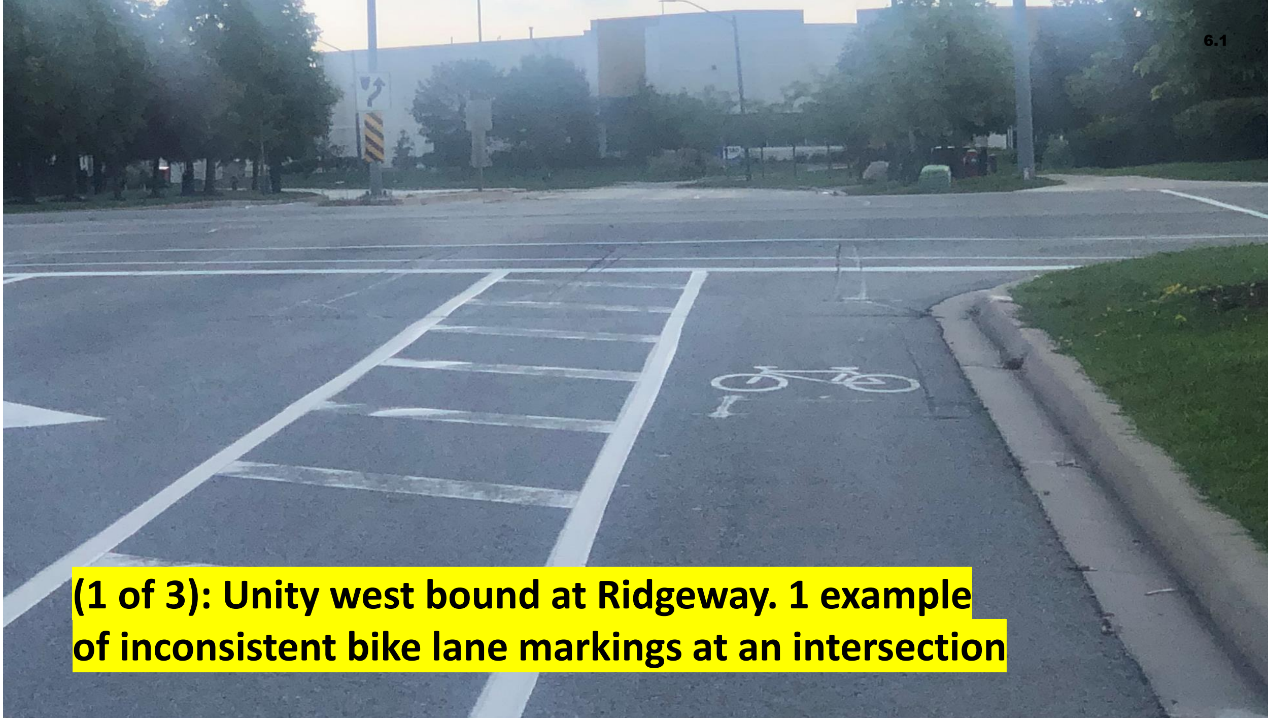
(1 of 3): Unity west bound at Ridgeway. 1 example of inconsistent bike lane markings at an intersection