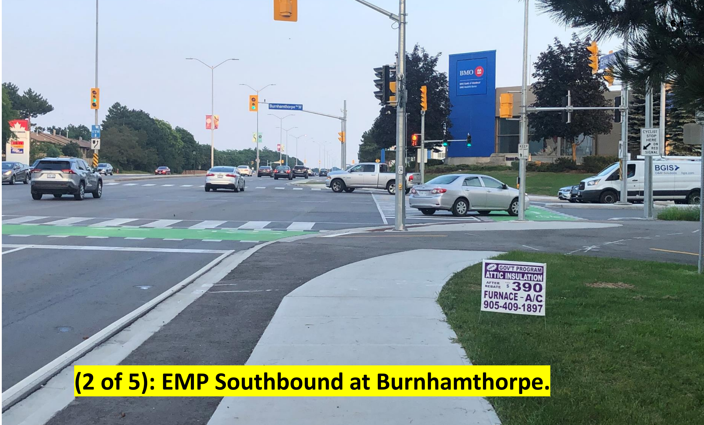
(2 of 5): EMP Southbound at Burnhamthorpe.