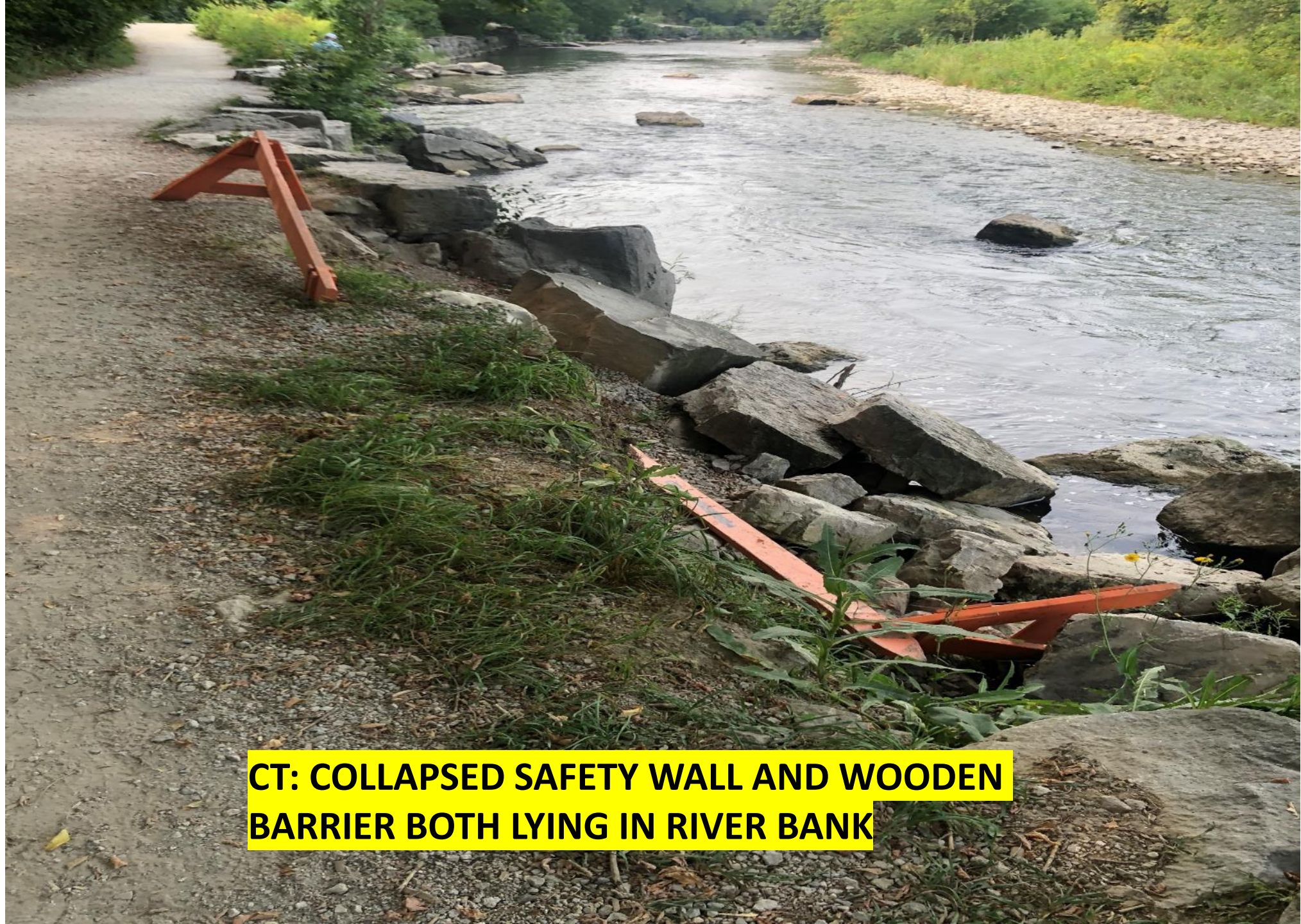
CT: COLLAPSED SAFETY WALL AND WOODEN BARRIER BOTH LYING IN RIVER BANK