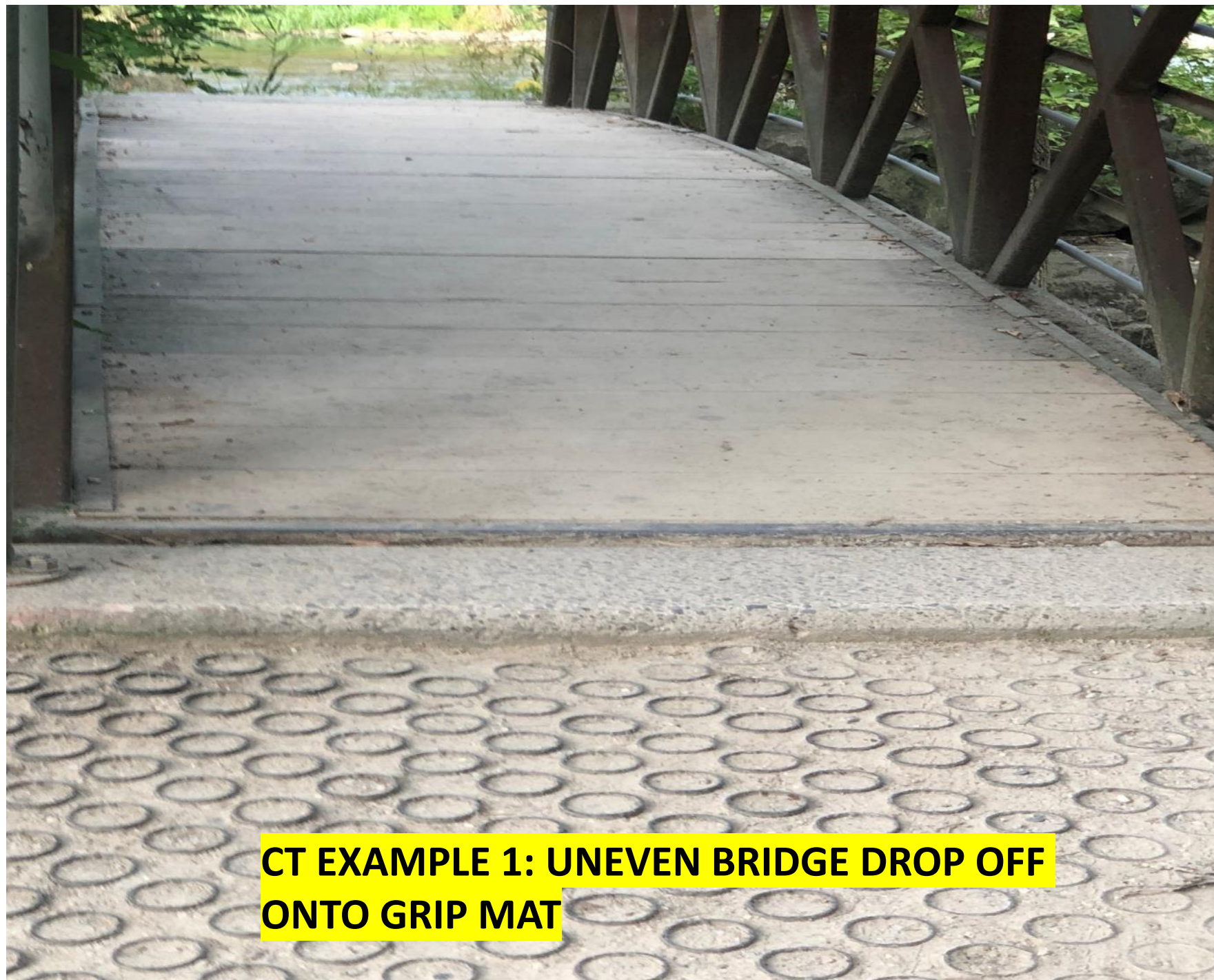
CT EXAMPLE 1: UNEVEN BRIDGE DROP OFF ONTO GRIP MAT