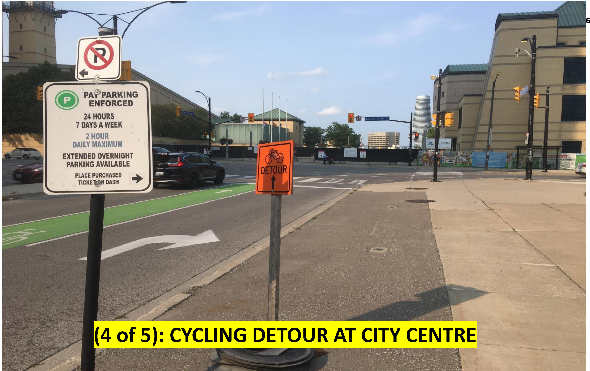
(4 of 5): CYCLING DETOUR AT CITY CENTRE