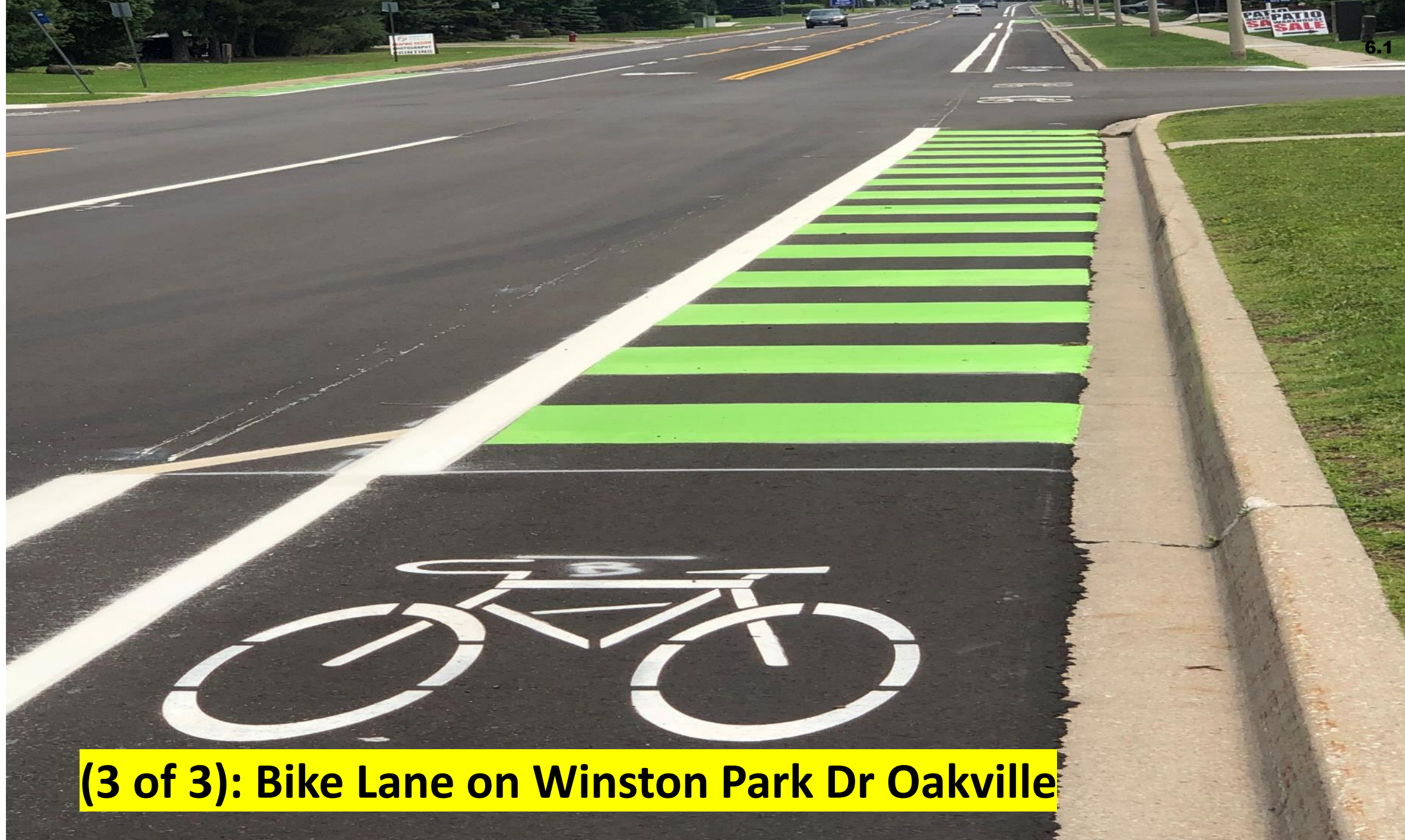
(3 of 3): Bike Lane on Winston Park Dr Oakville