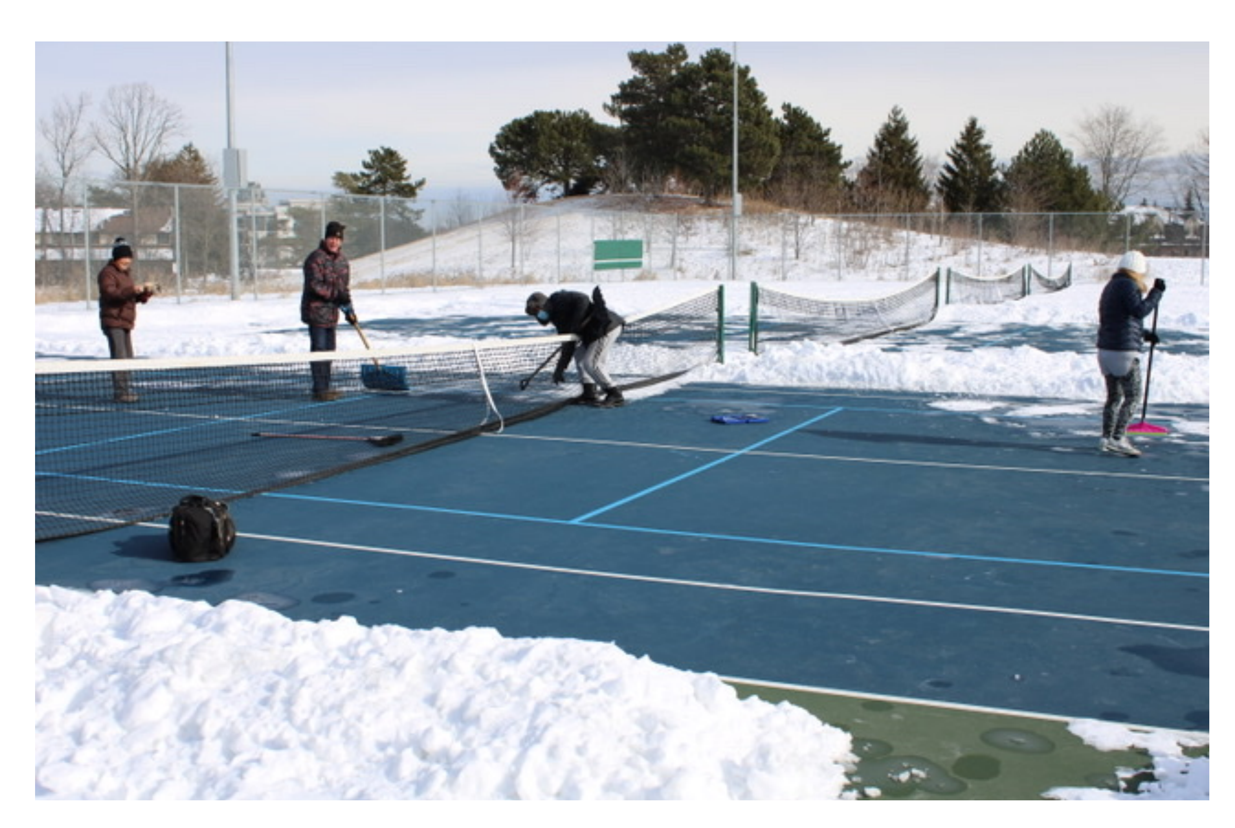
Now this is dedication to the sport - Brookmede Park WINTER 2020/21