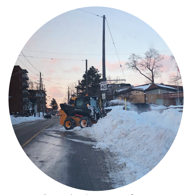
Crew clearing snow after a snow event - Action #60