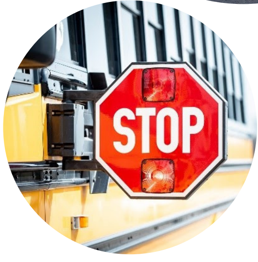
School bus stop sign - Action #82

Automated Speed Enforcement camera in front of a school – Actions #78-80