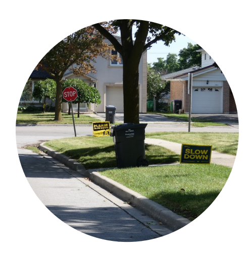
"Slow Down" lawn signs -Action #89