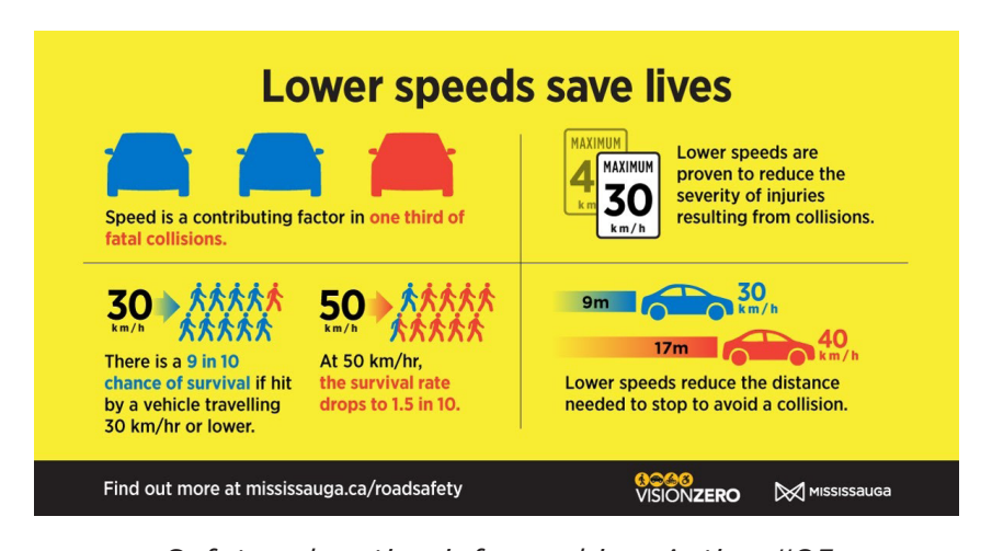
Safety education infographic - Action #85