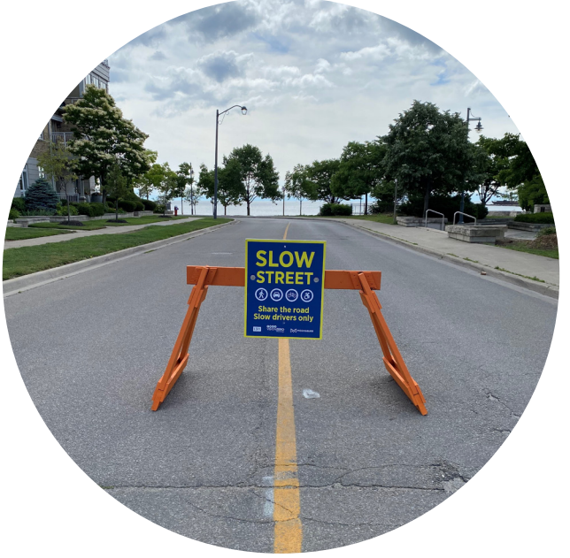
Slow Street deployment as temporary traffic calming - Action #26