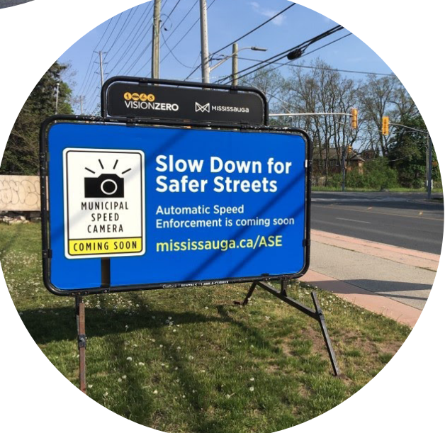
Automated Speed Enforcement curb information sign - Action #78