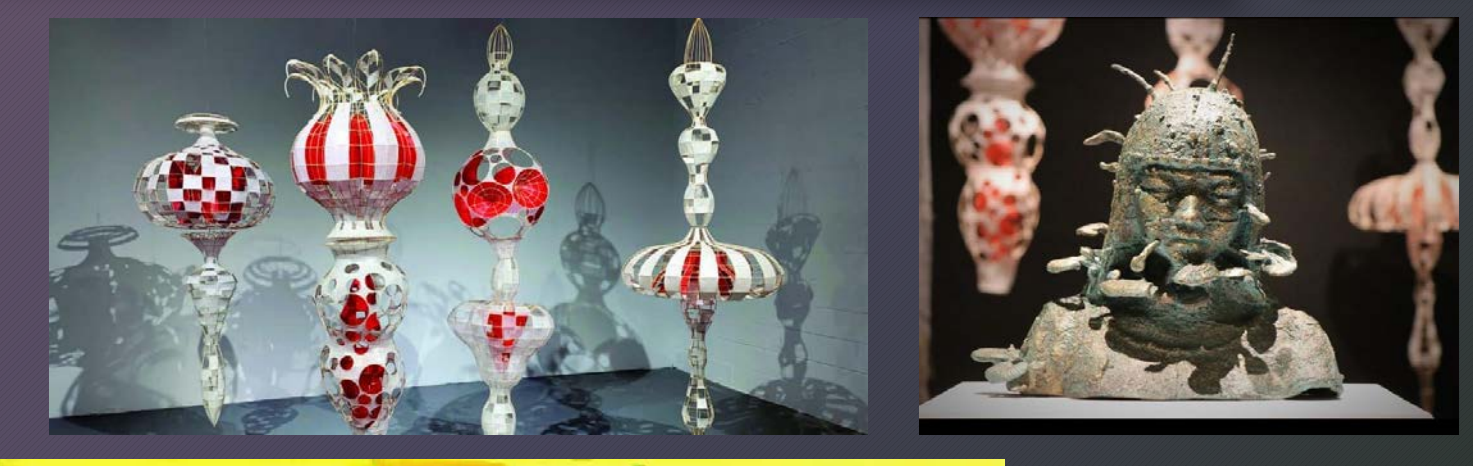
XiaoJing Yan Qi of Water