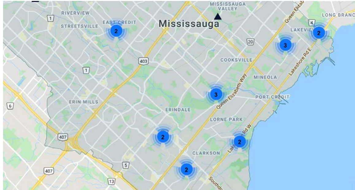
Some water monitoring stations in Mississauga