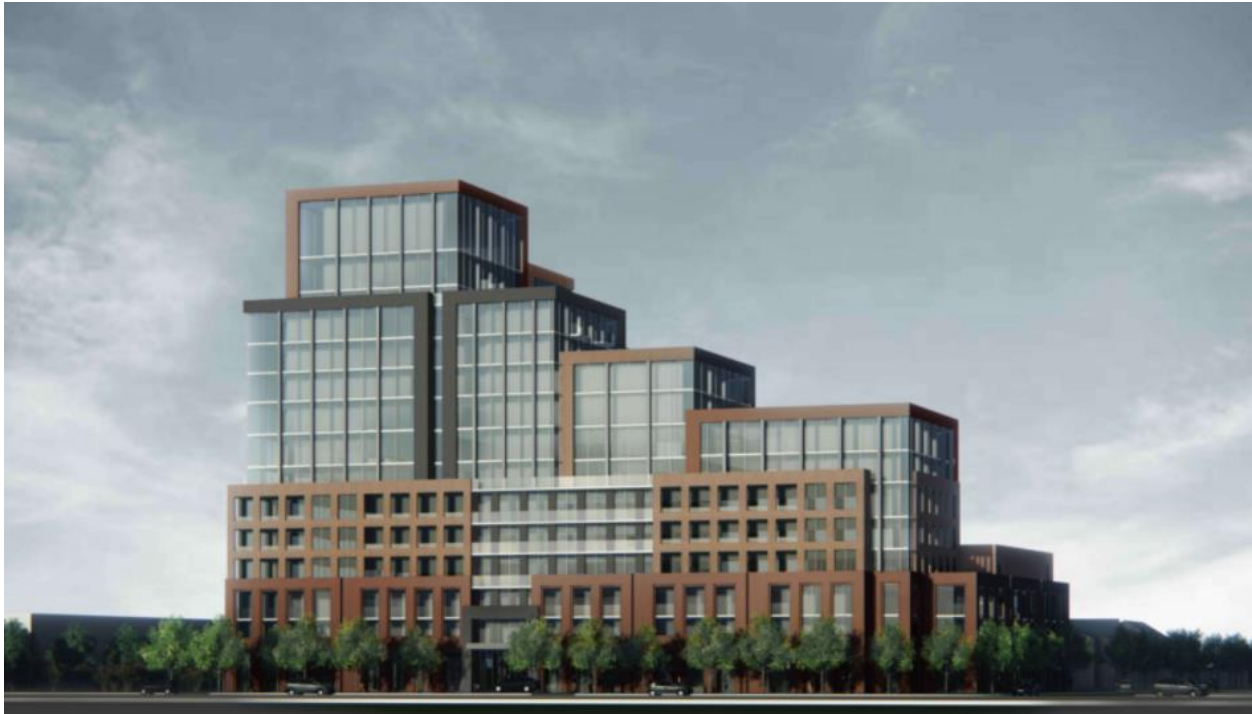
Applicant's rendering of the proposed 14 storey mixed use building