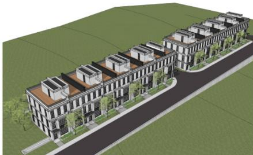
Applicant's rendering of the proposed 18 townhomes