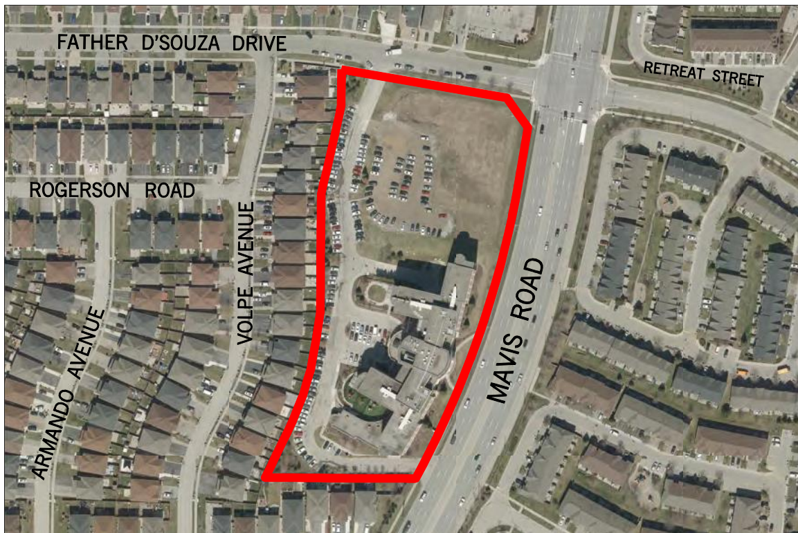
Aerial Image of 5510 Mavis Road