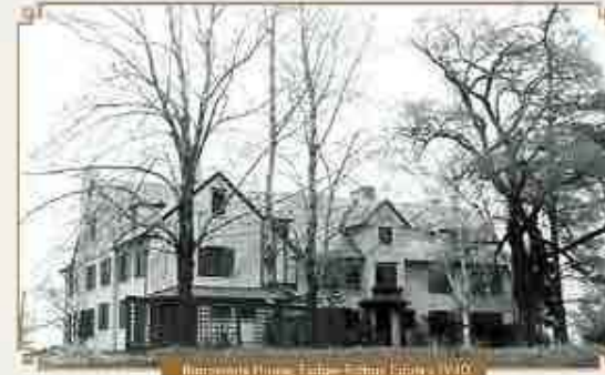
Barrymede House, Fudge Family Estate 1920