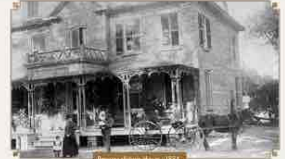
Barrymede House 1920

Several affluent Toronto businessmen built summer