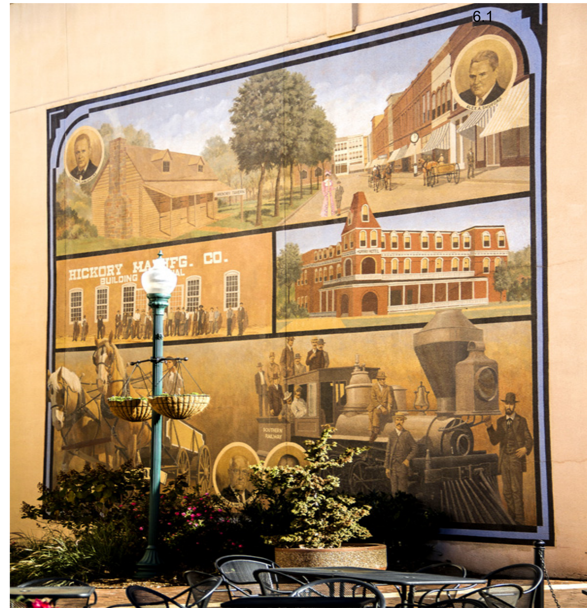
1141 CLARKSON ROAD NORTH MISSISSAUGA