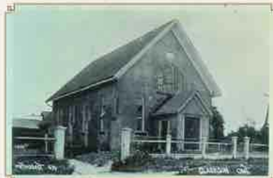
Clarkson Methodist Church 1910