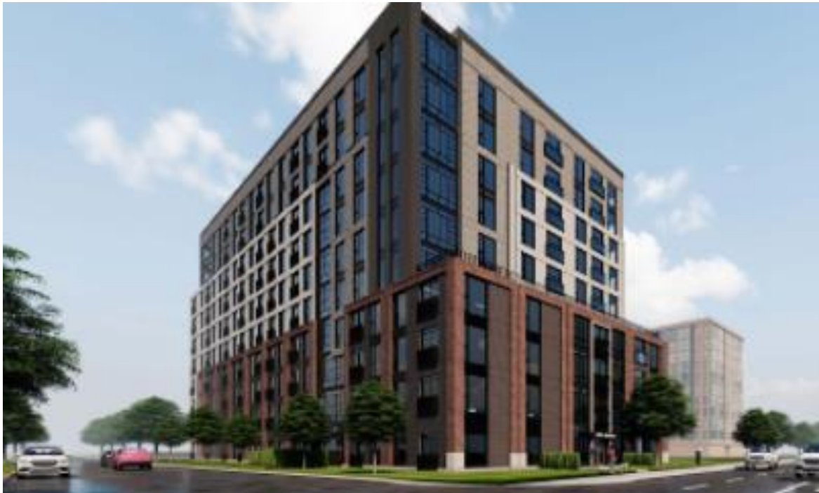
Applicant's rendering of the 10 storey rental apartment building