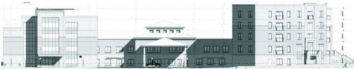
East Facing Elevation along Fifth Line West