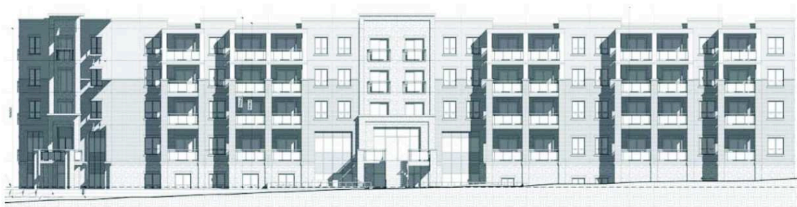
North Facing Elevation along Dundas Street West