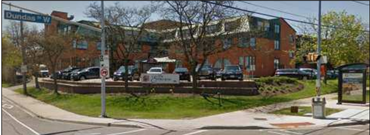
Image of existing conditions facing southwest

North: Ethan Allen furniture store, Petro Canada gas station, Speedy Auto Service, and Peel Region police station East: Petro Canada gas station and detached homes South: Detached homes West: Lutheran Church and detached homes