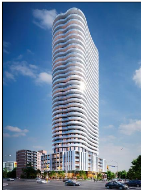
Applicant's rendering of the 36 storey residential condominium apartment building