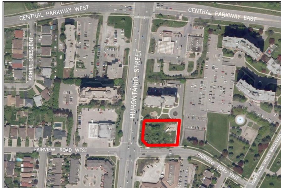
Aerial image of 1 Fairview Road East

The property is located at the northeast corner of Fairview Road East and Hurontario Street within the Downtown Fairview Character Area. The site is currently vacant.