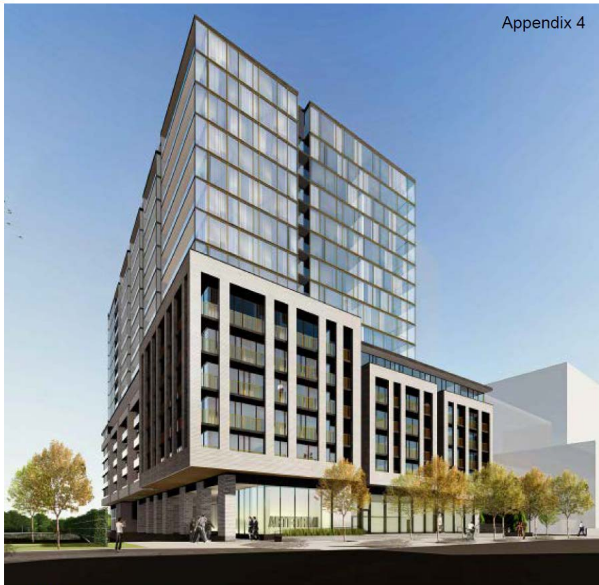
PERSPECTIVE VIEW FROM DUNDAS STREET EAST