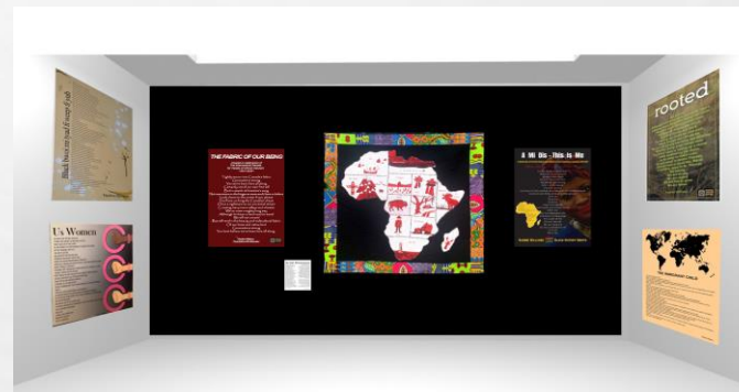
View Find[H]er Contact Photography

Black History Month Celebration The Fabric Of Our Being | IDPAD Project