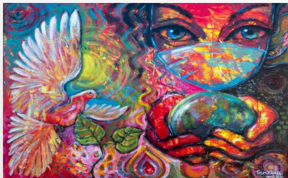
Love Lab Showcase

....till all are healed, a tribute to front line workers