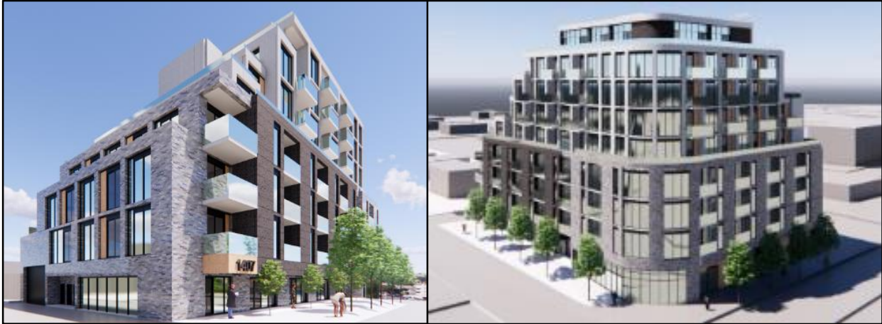
Applicant's rendering of the proposed 9 storey apartment building