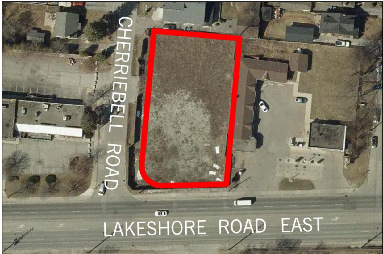
Aerial image of 1407 Lakeshore Road East

The property is located at north-east corner of Cherriebell Road and Lakeshore Road East, within the Lakeview Neighbourhood Character Area. The site is currently vacant, however, prior to the demolition of the previous building, the site had a restaurant operation, with parking facing both public streets. The site previously enjoyed access onto both Lakeshore Road East and Cherriebell Road.