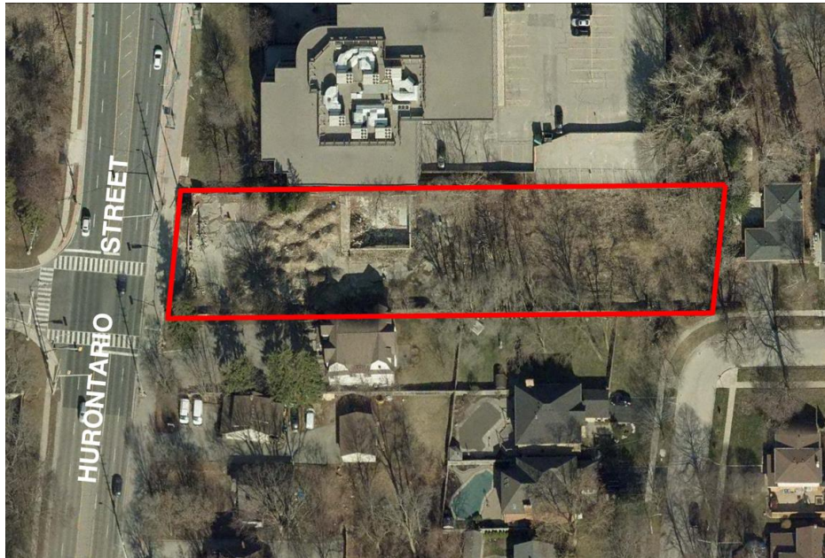
Aerial Image of 1575 Hurontario Street