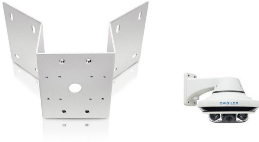
Example of Bracket and 270 degree IR Camera

CLIENT TO SUPPLY AND INSTALL UPS IF NEEDED.