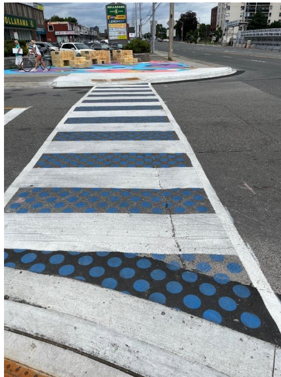
Jaguar Valley Drive Pilot, 2022