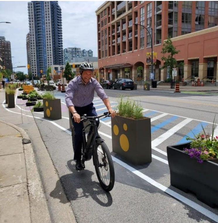
Living Arts Drive Pilot, 2019