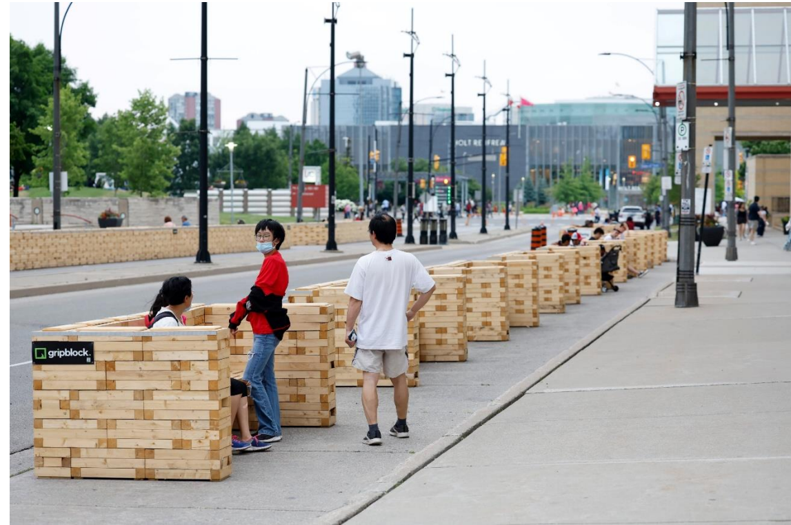
Princess Royal Pilot, 2022