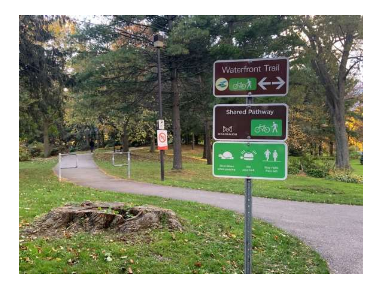
Figure 3: Kilometres of cycling facilities in place in Mississauga