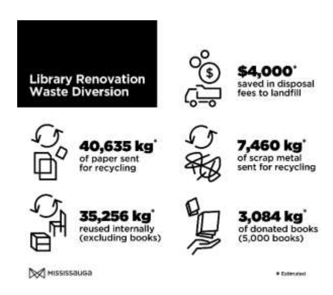
Figure 4: Central Library renovation waste diversion statistics.

The project contributes to the City's vision of becoming a waste diversion leader by incorporating a philosophy of reduce, reuse and recycle. To measure the project's success and serve as a model of best practice for future renovation and construction projects, the process was fully documented.