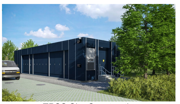
TPSS Site Construction