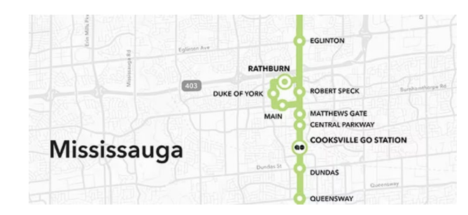
EA Addendum for Downtown Loop