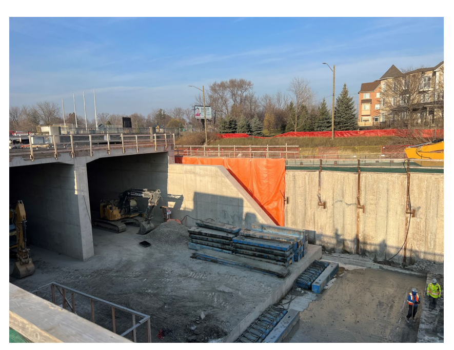
Push Box at Port Credit Station