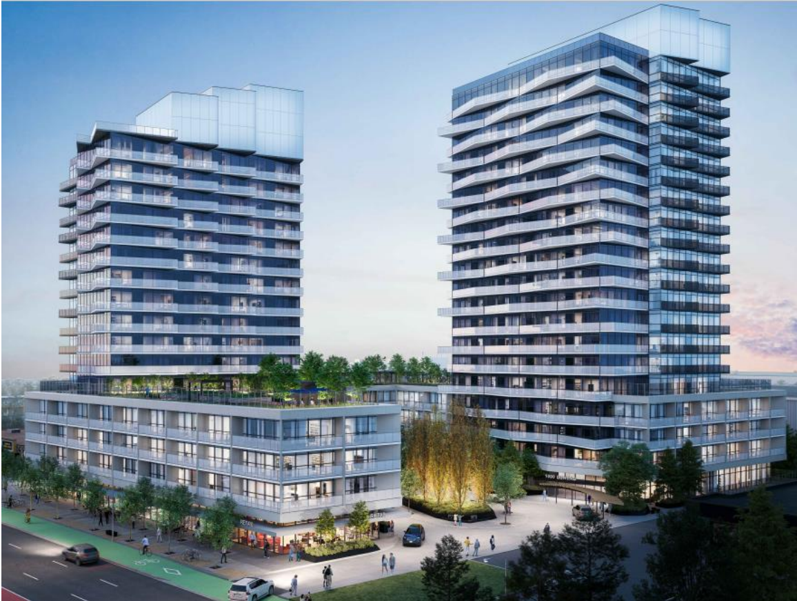
Applicant's rendering of the proposed apartment buildings with ground floor commercial space (facing southeast on Dundas Street East)