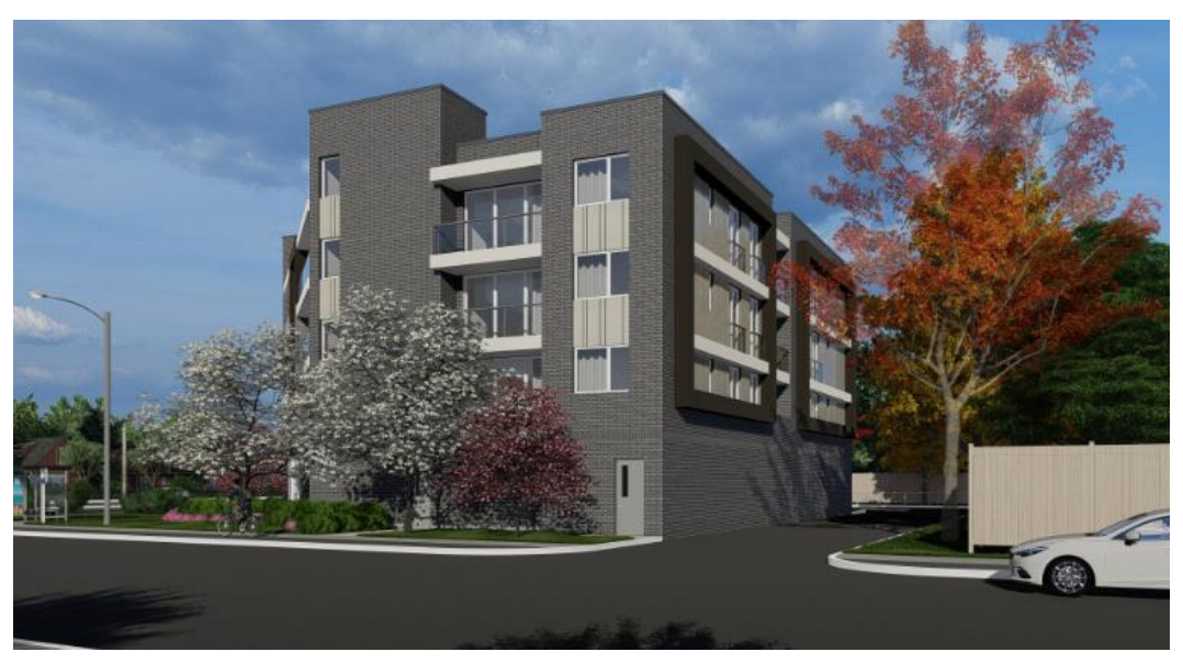
View looking southwest from Winston Churchill Blvd.

Appendix 2, Page 14 File: OZ/OPA 22-7 W9 Date: 2023/04/14