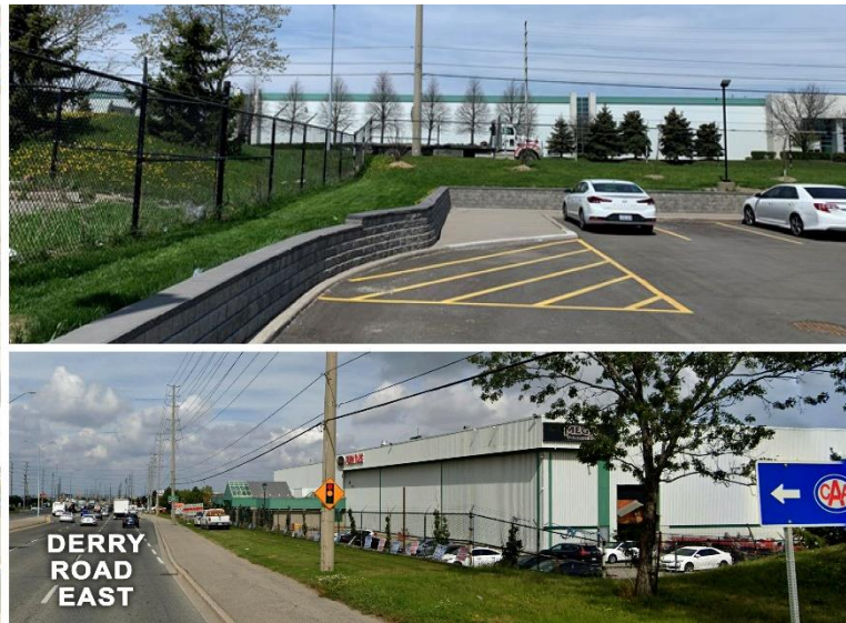
Images of the existing condition