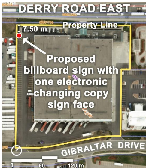
The location of the proposed billboard

The dimension of the sign face is 7.68 m x 3.84 m (25.2 ft. x 12.6 ft.), has a sign face area of 29.5 m 2 (317.5 ft 2 ), and the height of the billboard is 7.5 m (24.6 ft.) (Appendix 2).