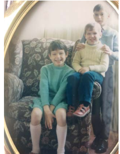
A personal story