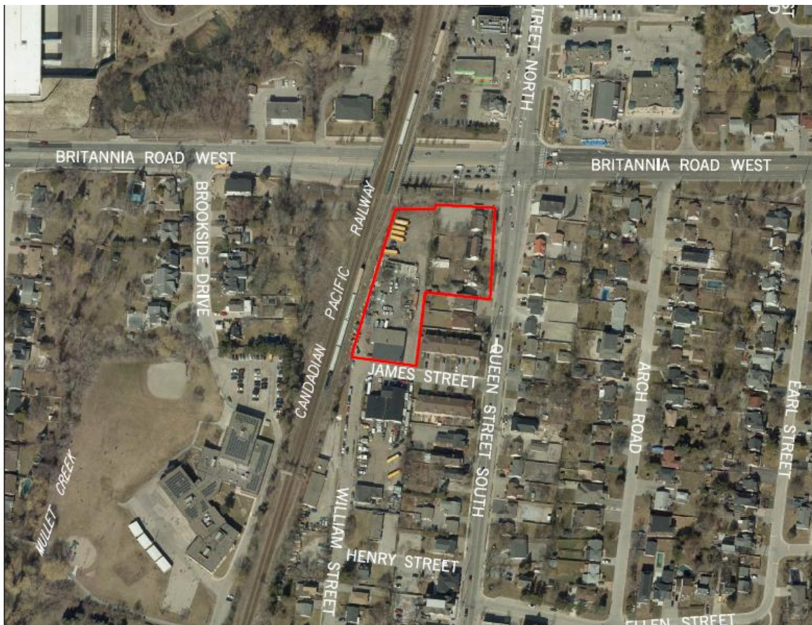
Aerial image of 6, 10 and 12 Queen Street, 16 James Street, and 2 William Street

The properties are located at the southwest corner of Britannia Road West and Queen Street South within the Streetsville Community Node Character Area. The site is currently occupied by three detached homes, one of which is used for medical office purposes. The James and William Street properties contain a commercial building that was formerly used as a vehicle service garage and were also used as a school bus depot.