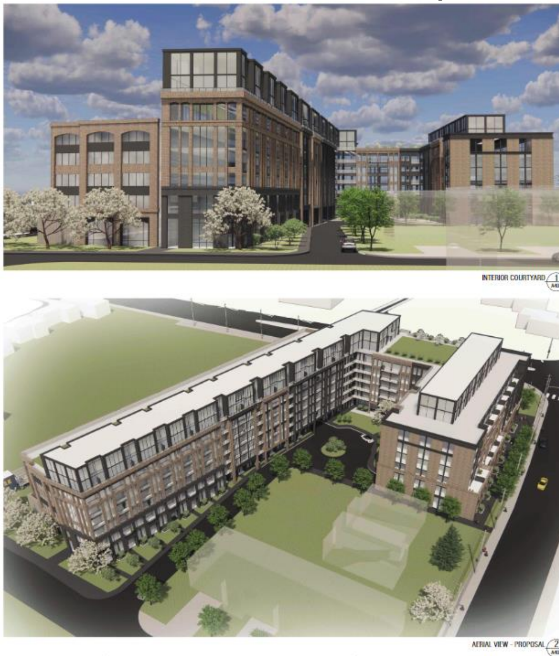
Applicant's rendering of the proposed 8 storey apartment building