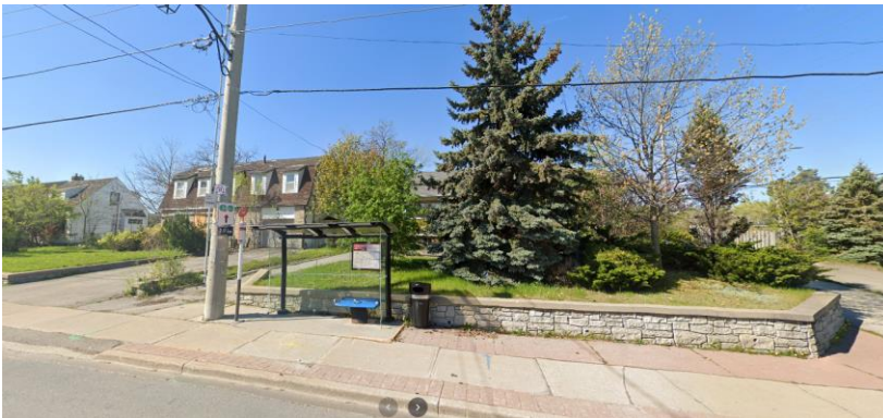
Images of existing conditions fronting Queen Street South (north half of the site)