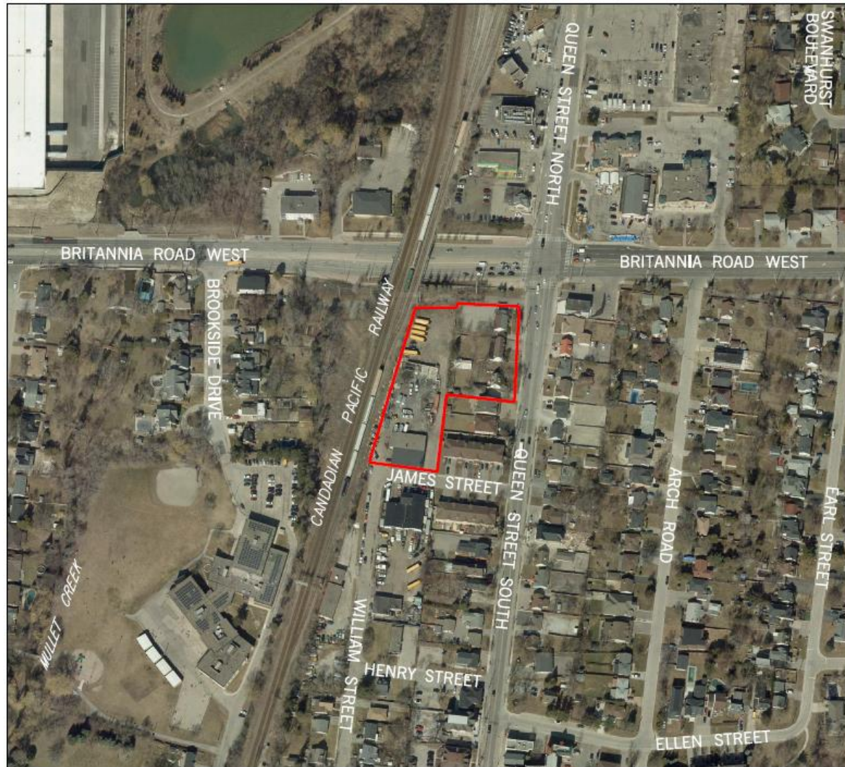
Aerial Photo of 6, 10 and 12 Queen Street South, 16 James Street, and 2 William Street