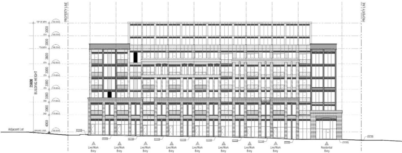
Queen Street Elevation