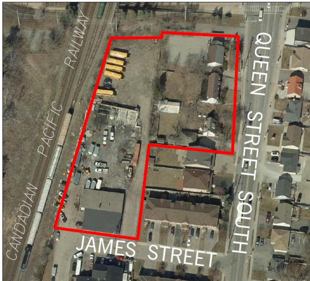
Aerial Photo of 6, 10, 12 Queen Street South, 16 James Street and 2 William Street

The subject lands consist of five separate properties located at the southwest corner of Queen Street South and Britannia Road West within the Streetsville Community Node Character Area. The subject lands are surrounded by a mix of residential and commercial land uses which are reflective of the historic, mixed use character of the area. The site is currently occupied by three detached homes, one of which was used for medical office purposes, a commercial building formerly used as a vehicle service garage and school bus depot.