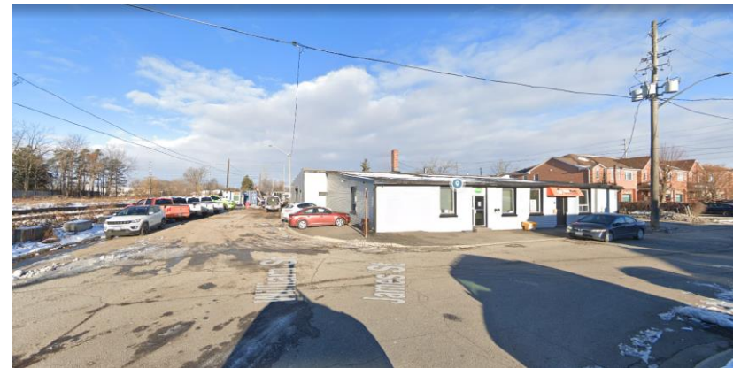
Image of existing conditions fronting James Street