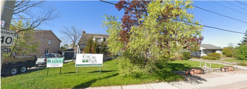
Images of existing conditions fronting Queen Street South (south half of the site)