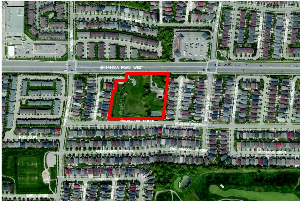
Aerial image of 1240 Britannia Road West

The property is located on the south side of Britannia Road West, east of Whitehorn Avenue within the East Credit Neighbourhood Character Area. The site is currently occupied by two detached homes.