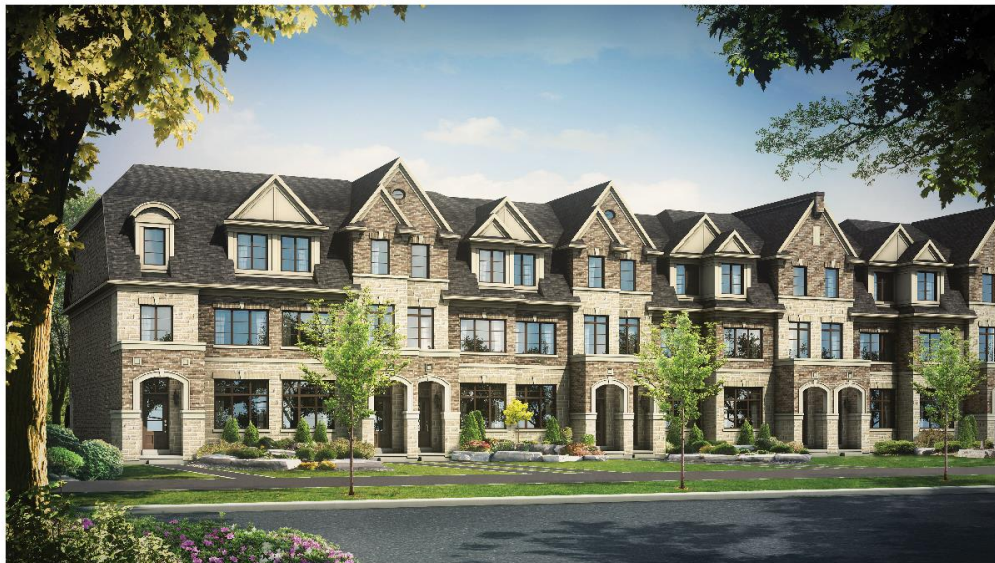
Applicant's rendering of the proposed townhomes