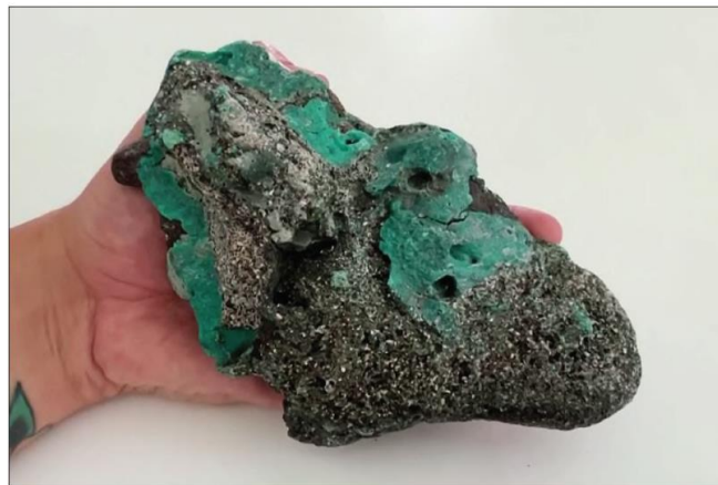
Figure 1 Example of "plastic rocks" from the Federal University of Parana, Brazil.

Practically, the sculptural objects are minimally impactful, using existing terrain to suggest that they are the visible portions of buried objects. The plaques follow plaque standards for heritage sites and public parks, and are demonstrably robust and safe, as well as being appropriate in scale and material.