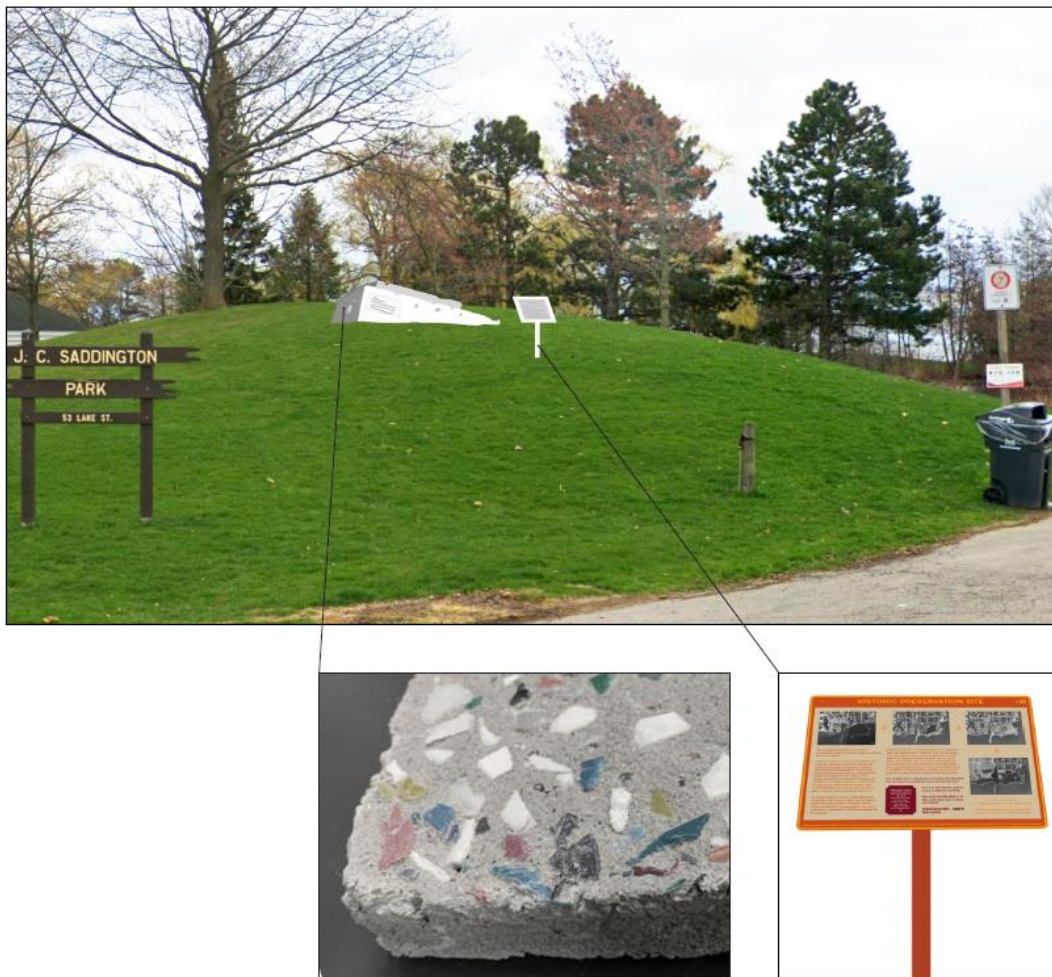
Figure 2 Early concept for the "monument" showing the plasticrete material and example of interpretive plaque. Note: All monuments will be located closer to the path to increase accessibility to the artworks.

Inspired by “fossilized plastic” that has been found around the world, the artists are proposing working with community members to collect plastic materials littered around the park and waterfront and then incorporating the found material into a concrete mix to create “plasticrete”. This material will then be cast into shapes and installed in the park as monuments to this period of time, peaking out of from the grass like fossils. The pieces will be accompanied by interpretive signage explaining the project and adding to the narrative.