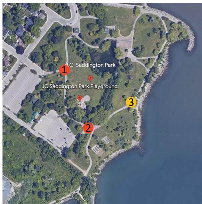
Figure 6 Proposed Locations for the Artwork

The artists have proposed two locations in the park for the monuments (shown by the red circles in the image below) and one location for an additional interpretive plaque (shown by the yellow circle). All locations will need to be finalized in consultation with City staff, and are subject to change.