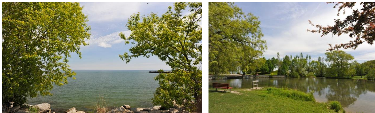
Figure 5 Images of J.C. Saddington Park

Throughout the park is a looped path system, pond, picnics areas and a playground. There are also heritage buildings and an informal amphitheatre.