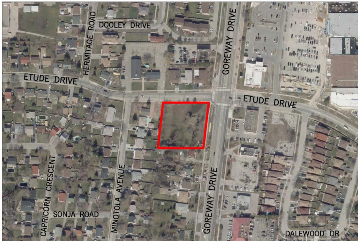
Aerial Image of 7170 Goreway Drive