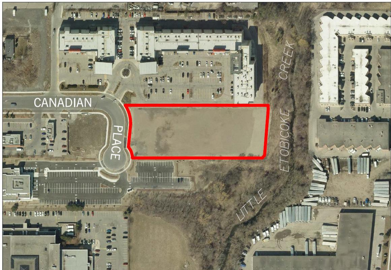
Aerial Image of 1075 Canadian Place

Given the amount of time since the public meeting, full notification was provided.