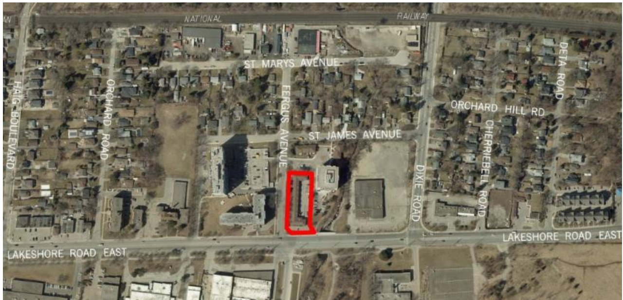
Aerial Image of 1303 Lakeshore Road East