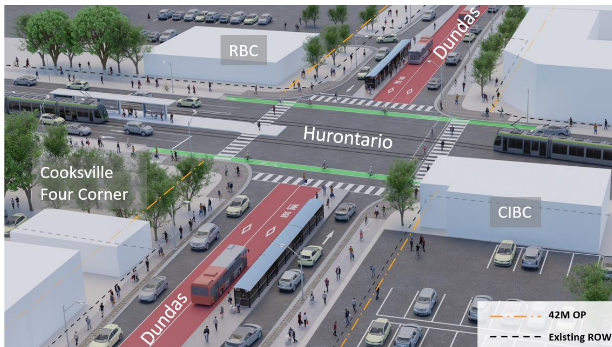
Figure 2 Cooksville Interim Design - Intersection at Hurontario & Dundas