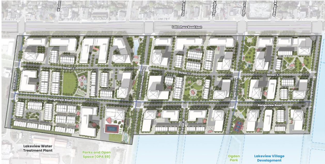
Applicant's Concept Plan

Two new public roads are proposed with the extension of Ogden Avenue, south of Lakeshore Road East, and a new road running parallel to Lakeshore Road East, illustrated below as Street 'L'.