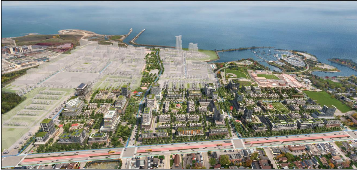
Applicant's Rendering of the Proposed Development Concept