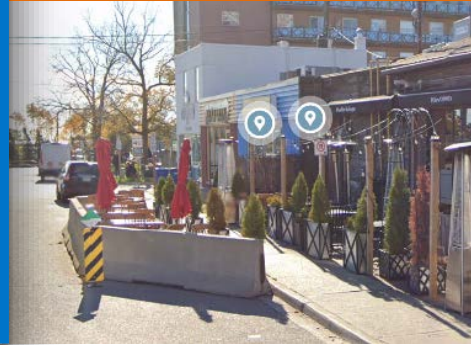
Parking Lay-by: City provided Jersey Wall barrier