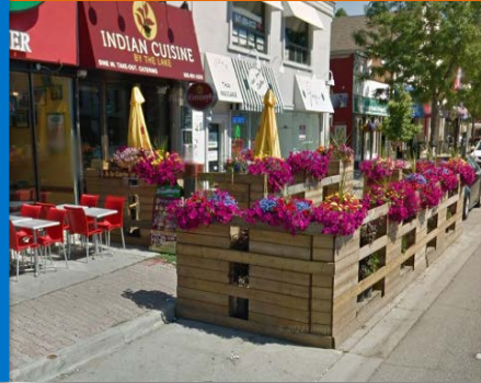
Parking Lay-by: Wooden Construction