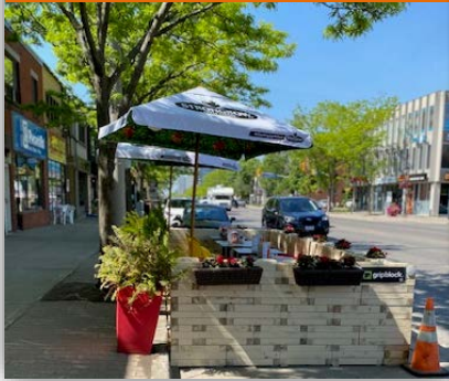
Parking Lay-by: Griplock Patio