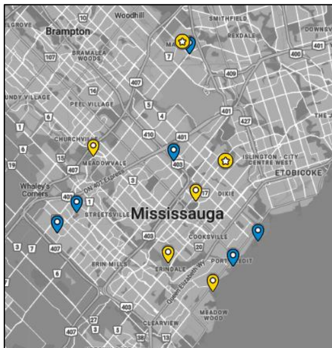
Figure 1: Location of Trail Pop-ups in 2023