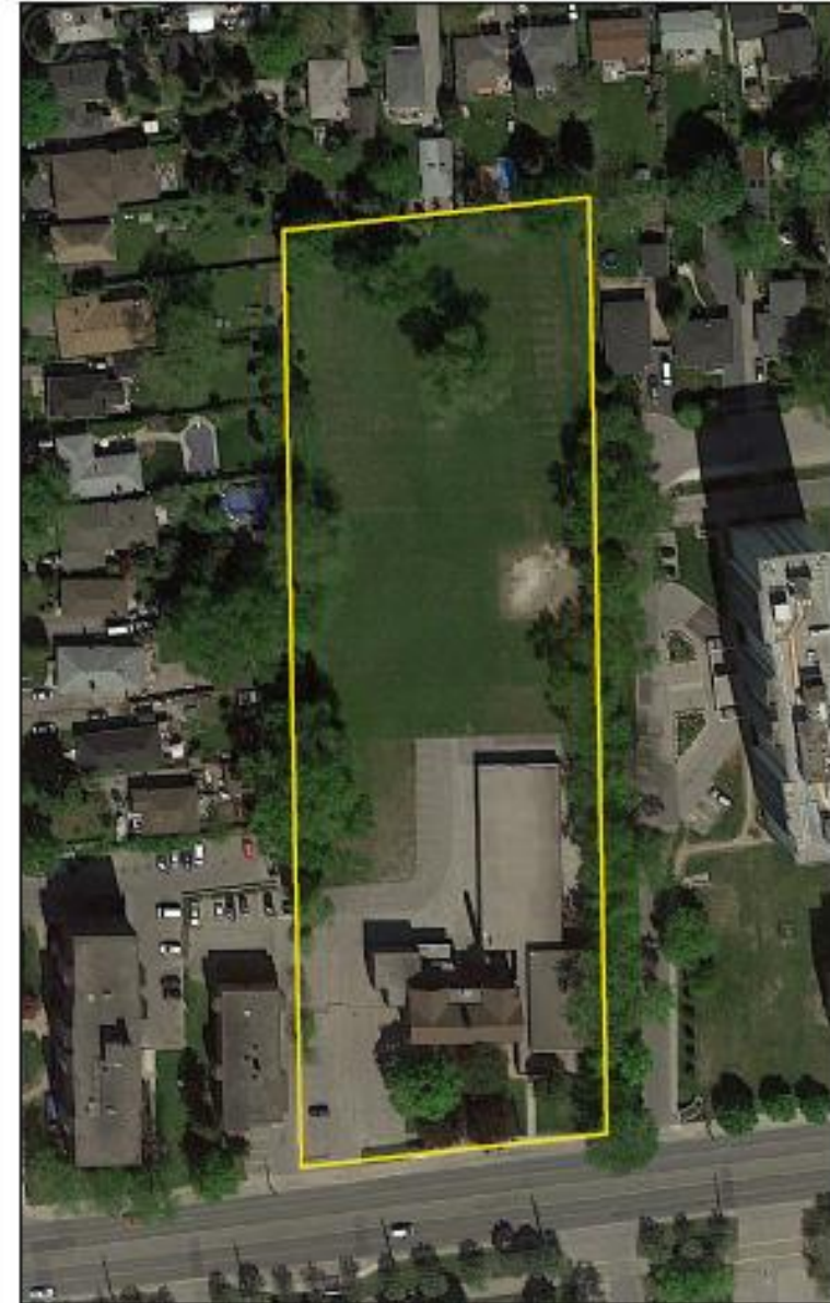
1239 Lakeshore Road East - property lines Plan H-23, Lots 11 to 14, and part of Lots 35 and 36 (Google Earth)