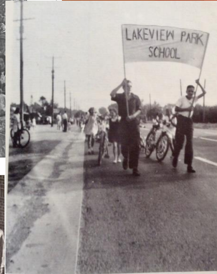
Lakeview Park School. School Parade along Lakeshore Road, September, 1947.