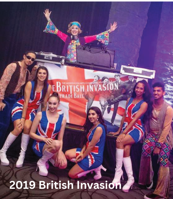
2019 British Invasion

Our last 3 MACsquerade Ball fundraisers for the arts, accumulated enough funds to help Celebrate 50! With a new, seed money-oriented arts creation program called Sauga Neighbourhood Arts Program! (SNAP!) 2024.