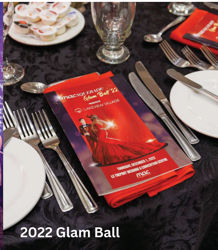
2022 Glam Ball