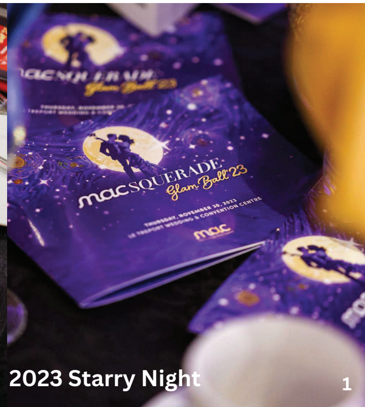
2023 Starry Night