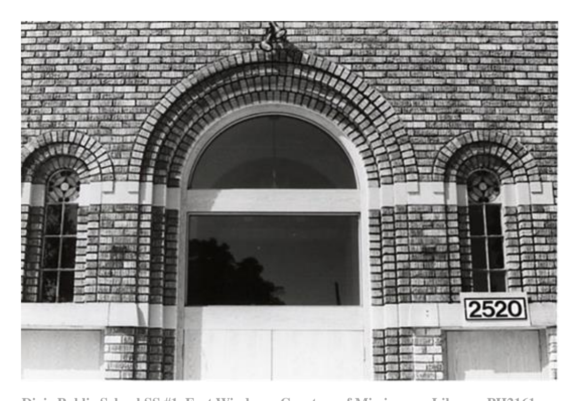
Dixie Public School SS #1, East Windows. Courtesy of Mississauga Library, PH2161.