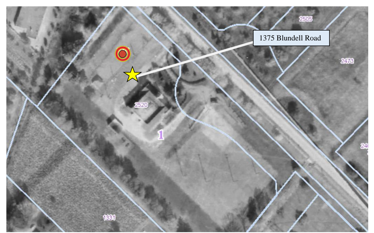
Aerial of property in 1954 without the church building