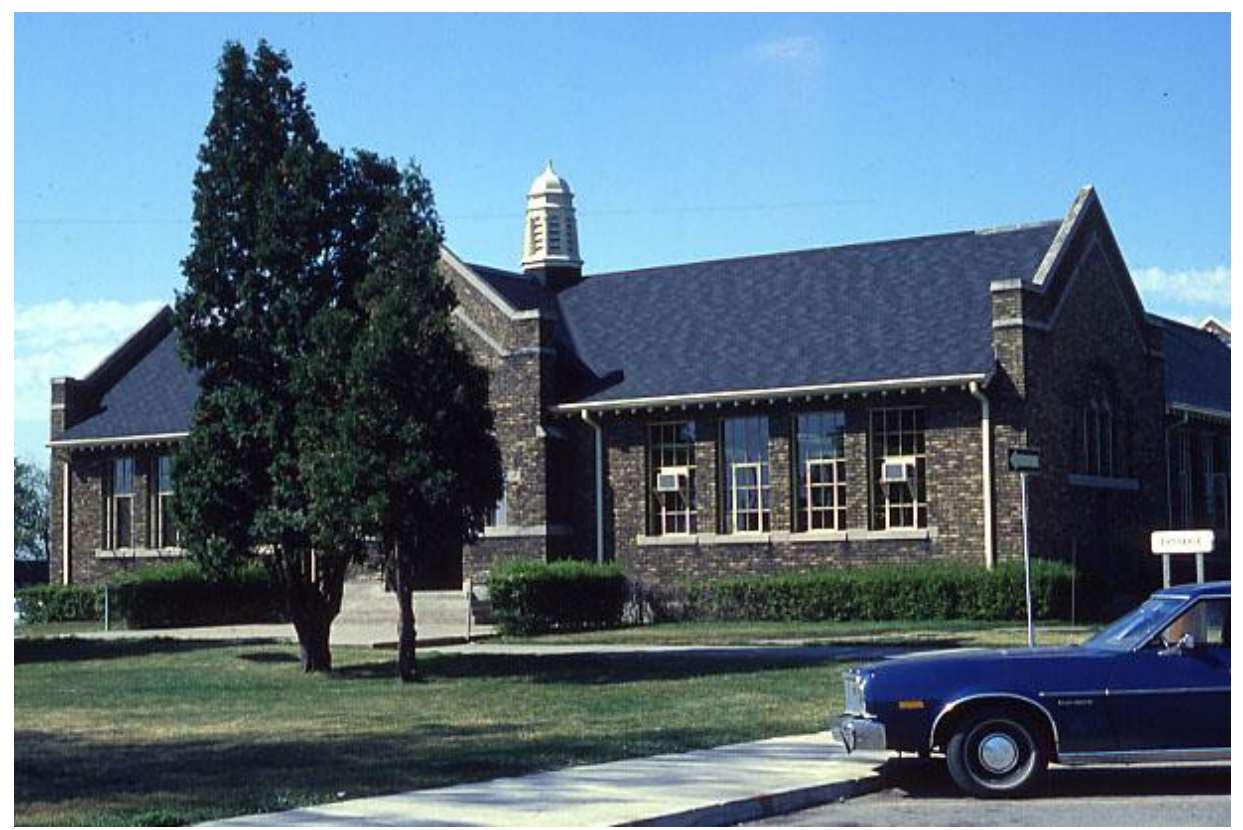
Dixie Public School SS #1. Courtesy of Mississauga Library, C799