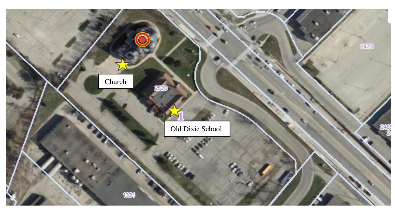
Aerial of property in 2022 with the church building