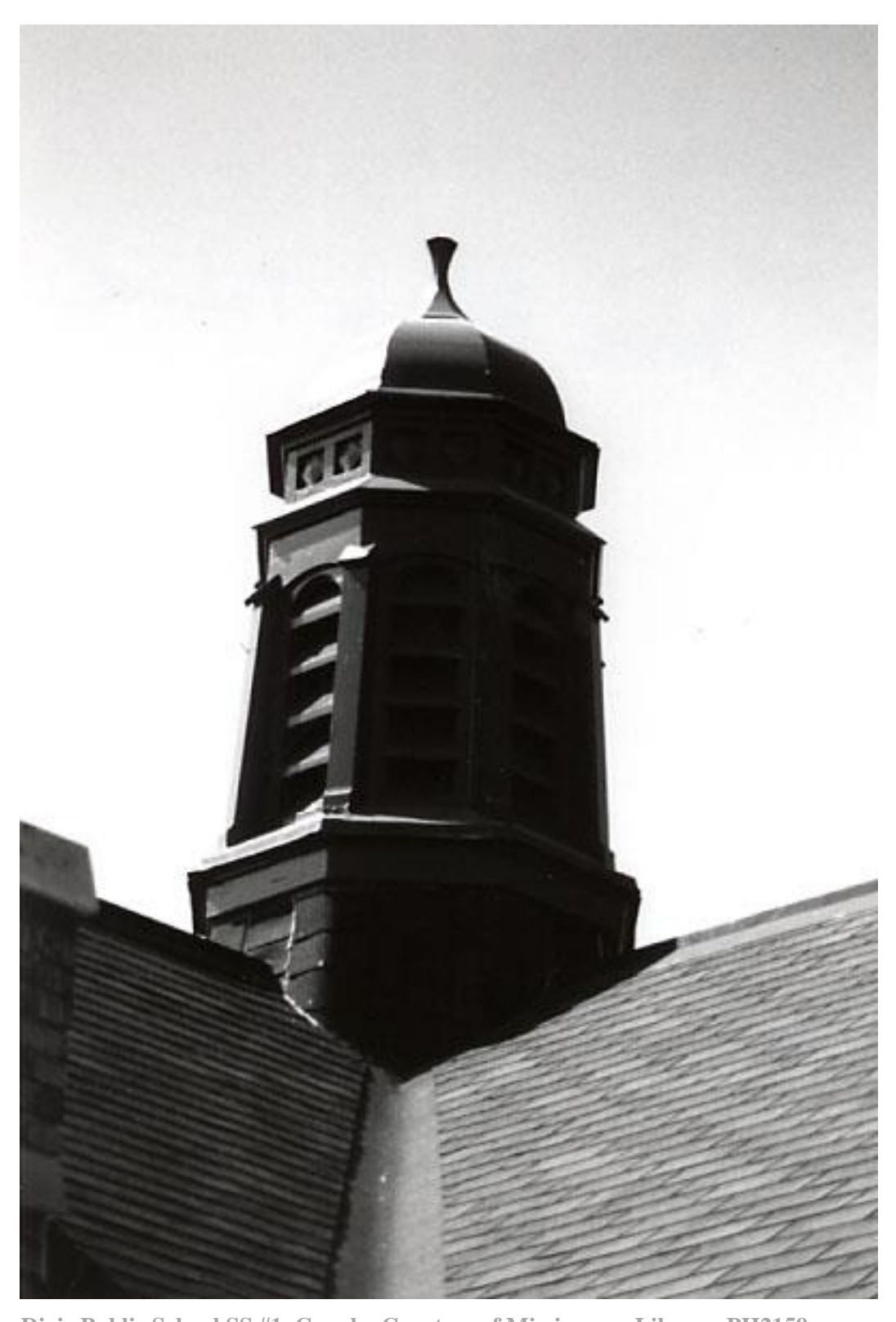
Dixie Public School SS #1, Cupola. Courtesy of Mississauga Library, PH2159