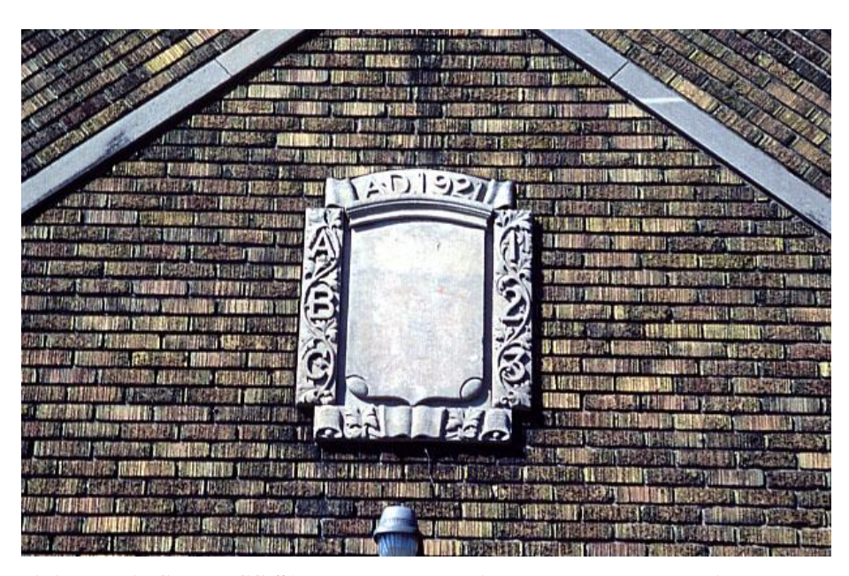
Dixie Public School SS #1. Plaque located in the centre gable, with the wording "A B C 1 2 3" and the date of construction, 1921. Courtesy of Mississauga Library, C800

Photo taken from Hicks, Kathleen. Dixie: Orchards to Industry. Mississauga: The Friends of the Mississauga Library System, 2006, p.53.