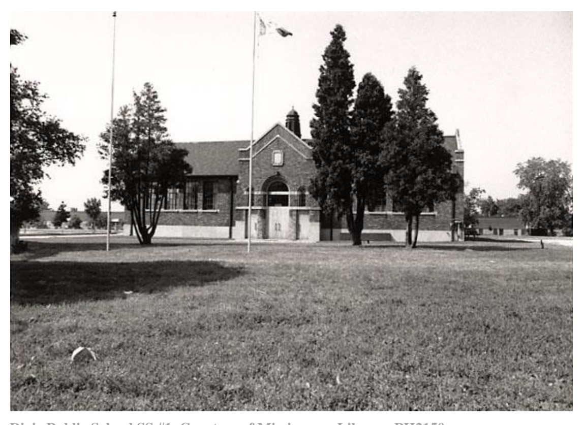
Dixie Public School SS #1. Courtesy of Mississauga Library, PH2150